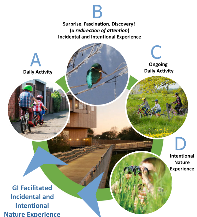
Fig. 1 Incidental nature experience cycle