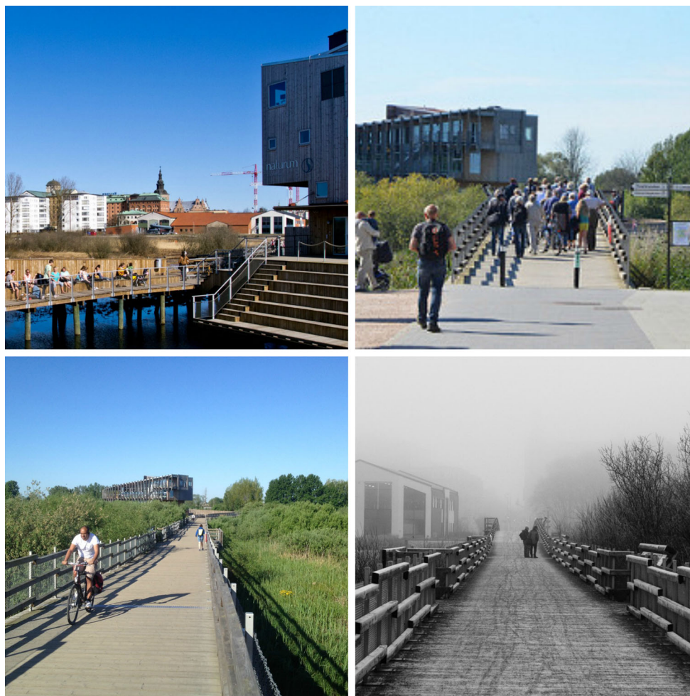
Fig. 3 Images of the walk/bike bridge in Kristianstad linking city sections, ecologically significant wetlands, etc.