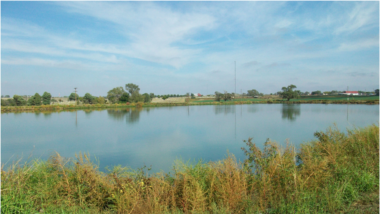
Fig. 2 Facultative lagoon in the treatment system in Wellington, TX, USA.