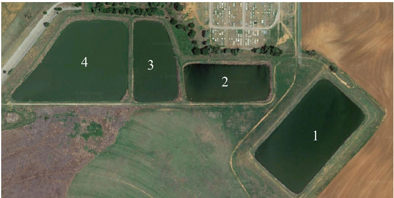
Fig. 1 A multiple pond treatment system in Wellington, TX, USA. The pond system consists of a facultative lagoon (1) and three oxidation ponds (2–4) (Google Map 2014)

Each multiple pond arrangement has its benefits and therefore an operator can change the pond arrangement depending on the situation. For example, ponds operating in parallel prevent interruption of treatment during the cooler months of the year. This is when a pond can experience low biological activity. Low biological activity can create anaerobic conditions within a pond. In addition, the application of ponds in parallel can reduce problems related to periodic low dissolved oxygen concentrations, particularly in the morning hours (USEPA 2011). Also, Mara and Pearson (1998) recommend this arrangement when the population of the city reaches 10,000. On the