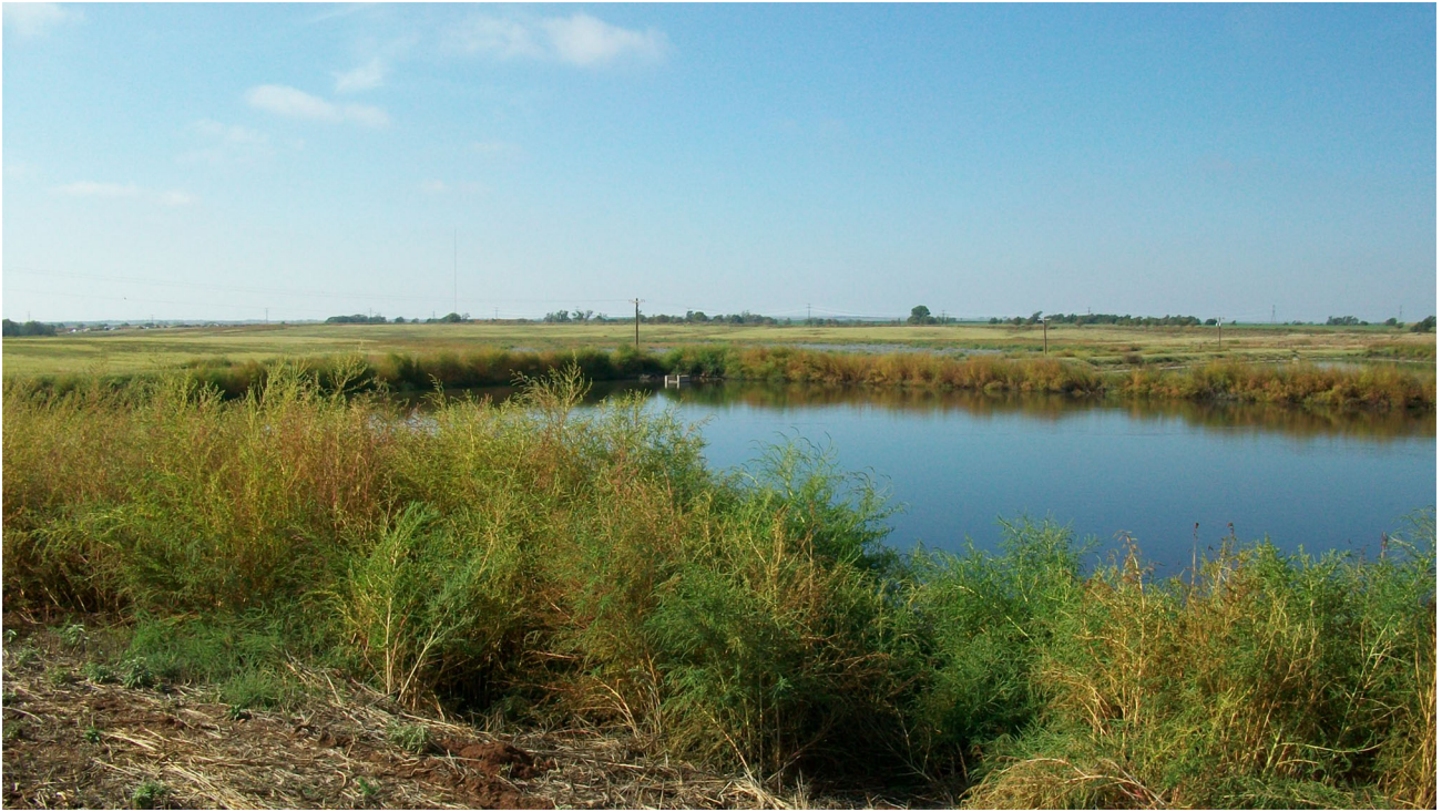
Fig. 4 Oxidation pond 2 in the treatment system in Wellington, TX, USA. Photograph taken by the author