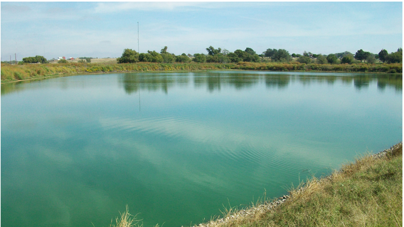
Fig. 5 Oxidation pond 3 in the treatment system in Wellington, TX, USA.