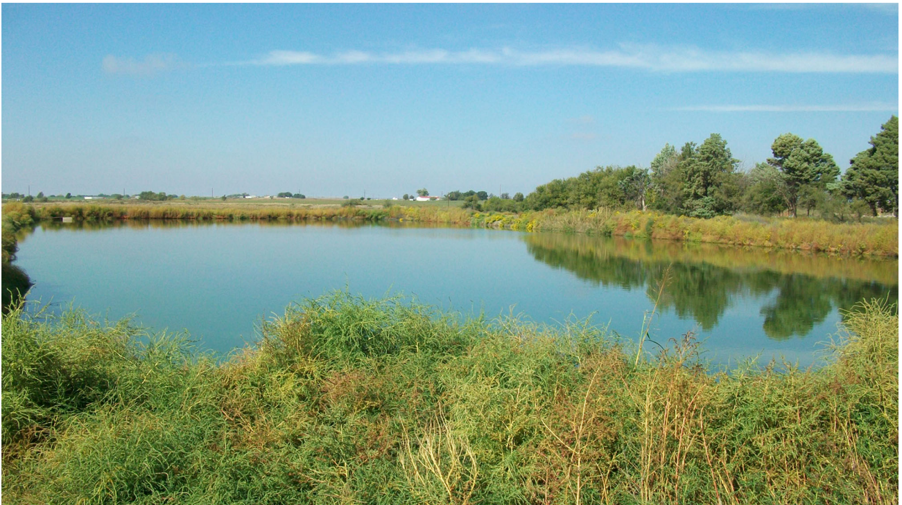
Fig. 3 Oxidation pond 1 in the treatment system in Wellington, TX, USA.