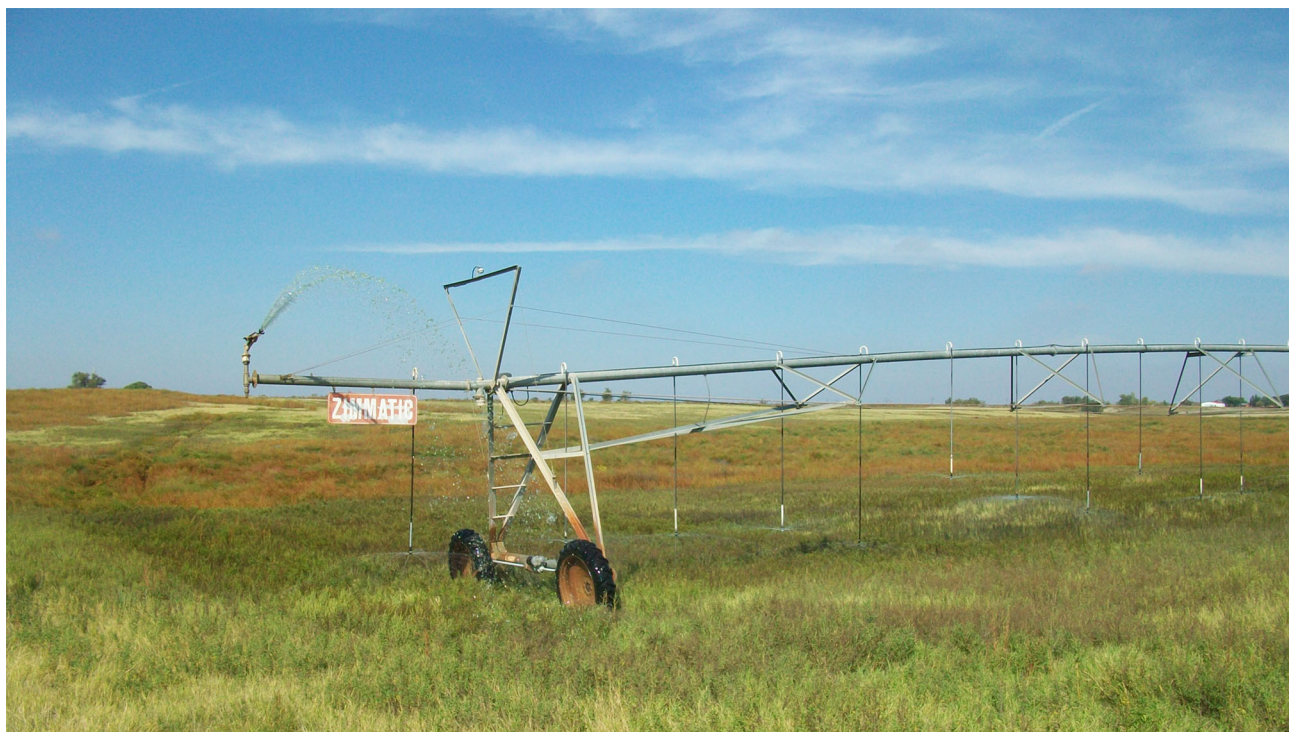
Fig. 6 Central pivot irrigation system directly applies effluent from the pond system in Wellington, TX, USA.

other hand, ponds in series are ideal during the summer months and also during periods of low biological loading (USEPA 2011). Nevertheless, the choice of applying multiple ponds can be beneficial for treatment as compared to a single pond arrangement.