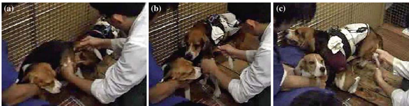
Fig. 1 Copulatory behavior by the hand method in the male dog. a Exposing female dog to male dog and sniffing; b Mounting; c Ejaculation by the hand method

Blood samples (2 ml) were collected into tubes containing heparin sodium (VENOJECT; Terumo, Tokyo, Japan) via the right cephalic vein with an indwelling needle and catheter at the following 10 time points: rest; exposure of the female dog to the male dog; mounting; first ejaculation fraction; second ejaculation fraction; third ejaculation fraction; and 5, 10, 30 and 60 min after the first fraction. All blood samples were kept on ice until centrifugation at 2,200\times g for 15 min at 4 °C, and plasma fractions were stored at –80 °C until analysis. Plasma NA and Ad concentrations were measured by high-performance liquid chromatography (C-R7A; Shimadzu, Tokyo, Japan) using a system equipped with an electrochemical detector