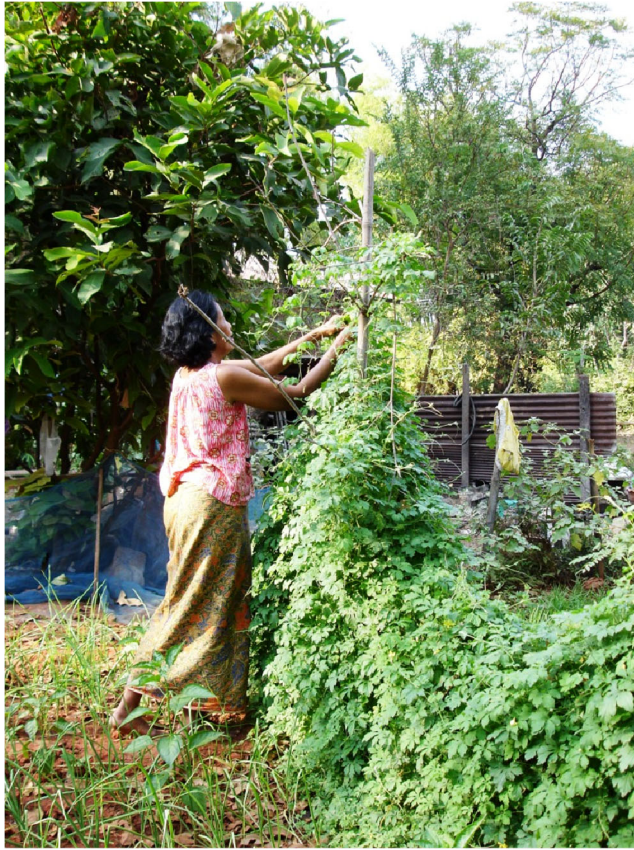
Fig. 2. Home garden in Ban Sa-at Tai, Kalasin, northeast Thailand.

transplanted or sown. In addition, domesticates that “birth themselves” are not considered “birth itself” type of plants; for instance, tomatoes that grow from consumption debris are not considered WFPs (Price 1997).