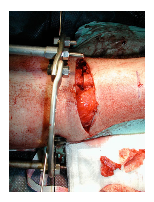
Fig. 3 Reducing the bone ends produces the acute shortening, and the transverse elliptical incision becomes closable without tension. Final fixation was undertaken in this case with an Ilizarov circular frame, but in more recent cases a monolateral external fixator is more frequently used