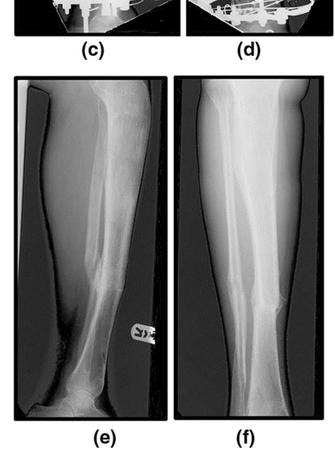
Fig. 4 Pre-operative AP radiograph ( a ). First post-operative radiograph ( b ) showing proximal corticotomy and frame. AP ( c ) and lateral ( d ) radiographs of frame during distraction histogenesis. Final AP ( e ) and lateral ( f ) radiographs following frame removal