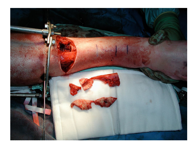
Fig. 1 Incision made transversely across tibial crest with non-viable bone removed

Surgical debridement was performed with a tourniquet applied but not inflated unless required to control bleeding. A transverse elliptical incision across the tibial crest was made to include necrotic, grossly contaminated or unsalvageable tissue in the zone of injury and the bone ends delivered through the fracture site. Non-viable bone was removed using osteotomes (Fig. 1). In earlier cases, an oscillating saw, well cooled with saline, was used. This was used less often in the later cases in the series to minimize thermal necrosis of the bone. The bone ends were either fashioned into a peg and socket or cut flat (Fig. 2), so that there was sound apposition, depending upon the fracture configuration and what produced the most stable final construct. After bony shortening, the elliptical transverse incision could often be closed primarily (Fig. 3) and, if not, the detensioned local soft tissues were mobilized utilizing tibialis anterior, gastrocnemius or soleus to cover any exposed bone with application of a split skin graft. Usually, a temporary external fixator was used to achieve bony stability, and this was