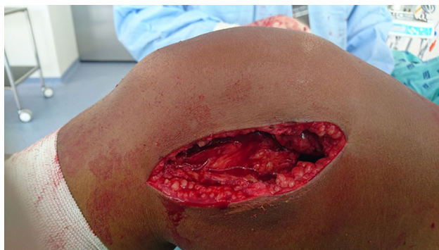
Fig. 1 First incision in the medial parapatellar region of the knee

The surgical technique is divided into three phases. In the first phase of the surgical procedure, two incisions are made. The first incision is made from the medial parapatellar aspect of the knee and extended to the medial side of the tibial tuberosity; this allows for access to the patellar tendon by releasing the medial retinaculum, entry into the suprapatellar synovial bursa and freeing of any intra-articular adhesions. During this step, sectioning of the medial collateral ligament is performed (Fig. 1). The second incision is made 5 cm distal to the greater trochanter and extended to the lateral region of the lower pole of patella, through which the lateral