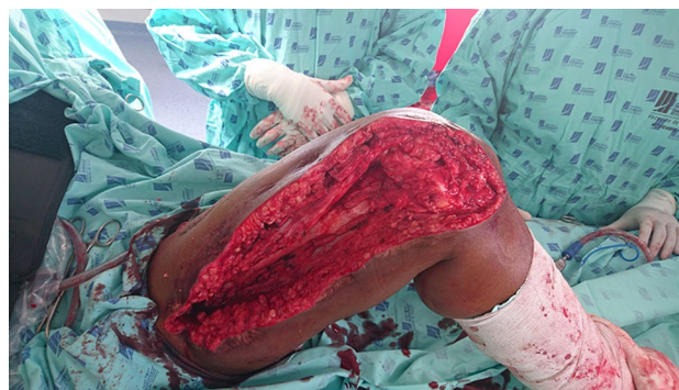
Fig. 2 Second incision from 5 cm distally of the greater trochanter to the lateral region of the lower pole of patella

All the patients had a knee extension contracture averaging 17° (0°–50°) pre-operatively. At the time of the