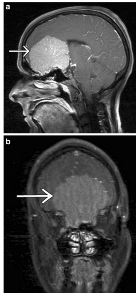
Fig. 2 MRI of the head shows a subfrontal meningioma with compression of the optic and olfactory tracts bilaterally (a, b)

Most reported cases of Foster Kennedy syndrome are associated with an intracranial mass. The majority are caused by meningiomas of the olfactory groove, falx, sphenoidal wing or subfrontal regions, but cases have been