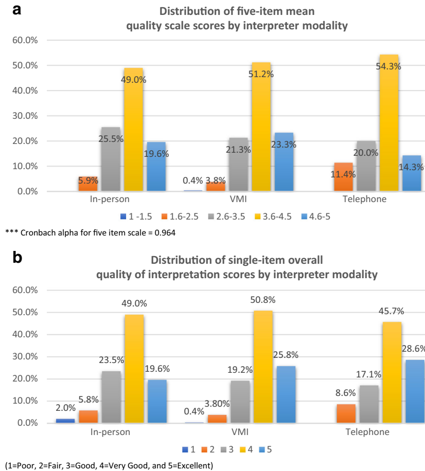
Figure 1 a Distribution of five-item mean quality scale scores by interpreter modality. b Distribution of single-item overall quality of interpretation scores by interpreter modality.

( p values ranged from 0.19 to 0.35 for the 5-item scale and from 0.18–0.69 for the single-item measure). Table 2 reports the unadjusted and model-adjusted means by interpretation modality for both outcomes. All adjusted and unadjusted means ranged from 3.73 to 3.98, suggesting average ratings that approached “very good.” In the adjusted analysis, patients rated VMI quality the highest, followed by in-person and then telephone; however, none of the pairwise comparisons was significant.