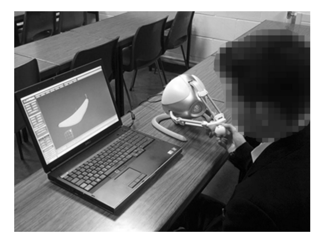
Fig. 1 A participant using CRE8 with the Novint Falcon to model an organic geometry

Subsequent to this design activity the participants were required to model a prescribed organic geometry using the same designated CAD system as before. This activity was introduced because it was envisioned that during the previous design task participants could conceive an idea which was within their capacity to model and therefore not present any problematic activity, consequently preventing an investigation into the heuristics they would exhibit. While the geometry of the organic stimulus was a familiar geometry, not having any prior influence on its design suggested an increased potential for problems to occur during the modelling task.