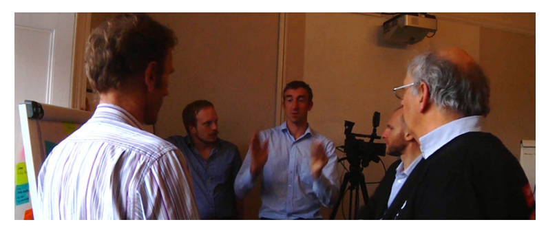
Fig. 2 Playframe opening: Participant starts speaking