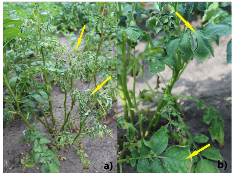
Fig. 2 a Changes in the growth of infected with Cs plants and wilting symptoms in the Gwiazda variety. b Chlorosis between the vascular tissues and curling of leaf blades in the Sagitta variety

normal and cold conditions delay the appearance of disease symptoms. Also Bishop and Slack (1982) confirmed that the cultivation of potatoes at a constant temperature of 24 °C caused the number of leaves with symptoms of ring rot to be significantly higher than the cultivation of the same variety at different daily temperatures (12 h at over 24 °C and 12 h at 5 °C).