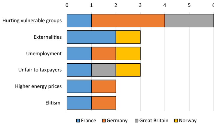
Fig. 4 Summary of energy injustices by type, case study, and commonality. a Top panel: simple frequency count by type and case study. b Bottom panel: qualitative synthesis by commonality.

mentioned by a single respondent or a majority of respondents, the bottom panel shows those that were most frequently mentioned by at least half of our respondents in each country (so by at least 8 respondents out of 16). Nineteen injustices met this criterion, which we then qualitatively organized into six categories (See Table 8 in the Appendix). The most common category included negative impacts on vulnerable groups, including working families or the elderly having to pay more for electricity or gas via time-of-use rates facilitated by smart meters; or those on low incomes in Germany having to subsidize the social costs of a feed-in tariff for solar energy that they cannot benefit from; or the risk management challenges nuclear waste will impose on future generations in France. The next three categories—with three injustices each—related to externalities, unemployment, and a burden on taxpayers. For example, our material discussed negative externalities from the French nuclear transition in terms of pollution from uranium mining and milling as well as the risk of a major safety accident; in Norway, the adoption of EVs has led to greater congestion for public transport in around the city of Oslo. Exacerbating job losses and unemployment were mentioned in France (locking out a renewable energy industry),