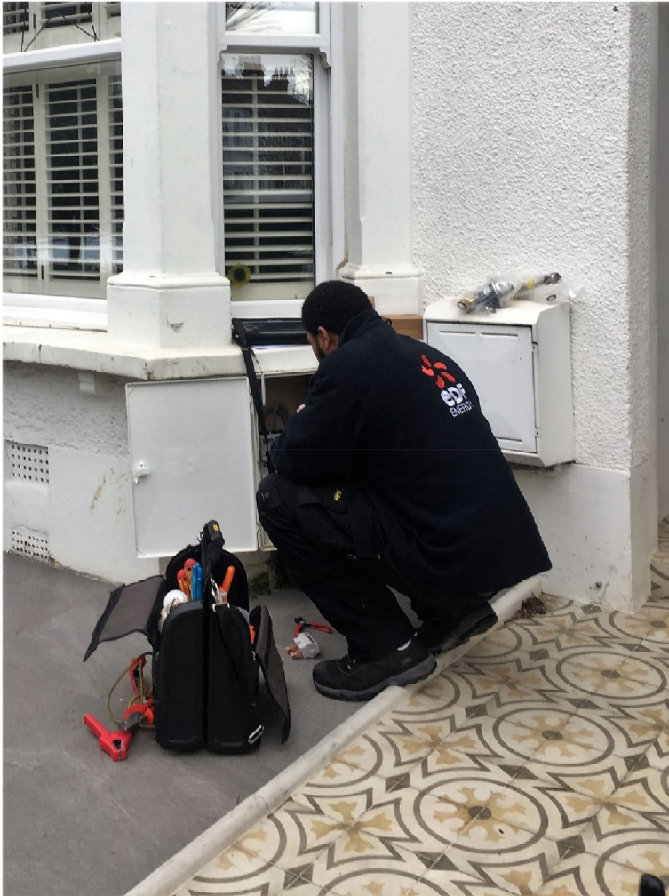
Fig. 2 A manual meter reader for EDF Energy in Greater London, February, 2019.

In Germany, respondents were not as harsh about procedural justice issues related to the solar transition, but still raised sobering concerns about planning processes, especially the capture of policy by industrial interests and a corresponding (and allegedly intentional) slowing down of the transition. G004 cautioned that within German planning and policy as a whole, “there’s been a tendency to follow the interest of large companies and so to say traditional industries, rather than follow the voice of environmental NGOs or people.” As a sign of this, G008 noted deliberate, visible attempts to slow rather than accelerate solar adoption in light of the caps put on renewable energy production in recent years: “the German policymaking process is totally corporatist ... the current government has been slowing down on the expansion of renewables since 2013. It’s a government composed of Social Democrats and Conservatives. Social Democrats are basically driven by the coal miners’ union and the Conservatives are driven by their allies in business. None of them want a renewables transition, by and large. Fundamentally the transition is working in the interest of industrial