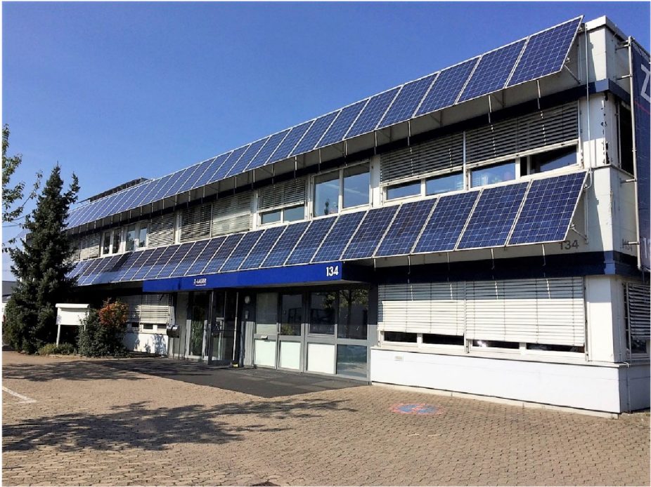
Fig. 1 Building integrated solar panels at the Intelligent Solutions in Light Offices in Vauban, Germany, September 2018.

Our data on Norwegian EVs led to the identification of a variety of distributive injustices, with three notable groups of possible losers, including those who cannot afford new cars, bus travelers, and ferry operators. Currently between 5 and 6% of cars on Norway's roads are EVs, which is set to increase significantly in light of the government's objective for all new cars to be zero emissions from 2025. N002 explained that the EV transition "is disadvantageous for those who don't have money to buy a new car or even a used EV... people on low incomes are excluded." N005 explained that, "One important group losing out is the public transport users in those areas where there are bus lanes and where there are so many EVs that the buses are delayed ... Bus travelers are among the possible losers." Others focused on ferry operators, with N001 noting that "it was standard policy for many years that EVs could go on ferries free of charge, even now they can travel at reduced rates." N004 added that "some of the ferry companies have been delivering red numbers because of so many EVs, there is a worry some are going out of business."