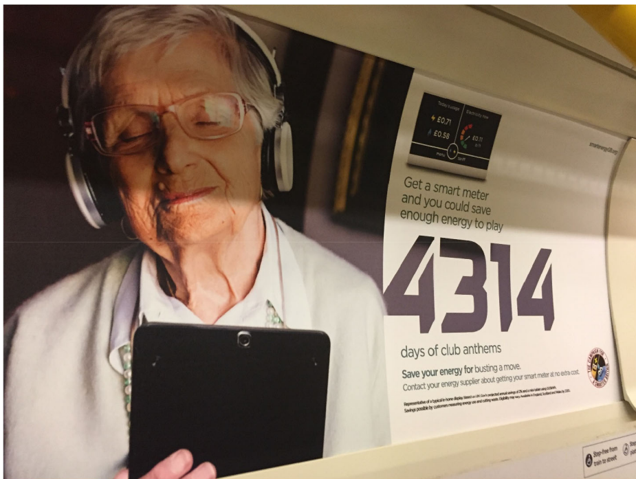
Fig. 3 Smart meter advertisement on the District Line Underground, London, November 2018.