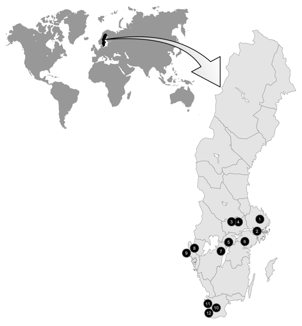
Fig. 1 Map of Sweden showing geographical positions of the edible forest gardens in the study

shade in hot and sunny climates, might not be useful when sunlight is a critical factor in intercropping systems. Especially in locations as Sweden, where the majority of the landscape is used to produce timber. It might be better for the tree layer to be lower, including smaller or coppiced trees that provide edible fruits, berries, leaves and possible nitrogen