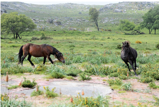
Fig. 1 Herding by a male horse. A male horse chases a female horse with his ears pressed back flat and his head lowered close to the ground.

Female–male interactions during such movements are similar to interspecific interactions, such as sheep–sheepdog or predator–prey interactions (Muro et al. 2011; Strömbom et al. 2014), which invoke the roles of chaser and escaper; however, a male horse is not a predator of a female horse. In addition, individuals in horse harem groups have long-term stable social relationships, unlike most animal species that have been observed in previous group movement studies