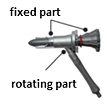
Fig. 1 HemorPex System © ANGIOLOGICA B.M. S.r.l., Pavia, Italy. Available at: http://www.hemorpexsystem.it/index.php?lang=1&id=home

Eighty-eight patients had grade II (76 %), 21 grade III (18 %) and 7 grade IV (6 %) hemorrhoidal disease; 6 of these patients had recurrent hemorrhoids after having underwent prior surgical treatment, while 6 had an associated local pathology such as anal fissures or anal polyps that we treated at the time of surgery for the prolapse. For all patients, we recorded pain levels after surgery by means of the visual analog scale (VAS), obtaining a mean VAS