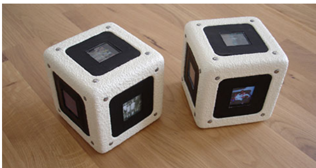
Fig. 1 The prototype of Cueb

Family communication is a prominent topic of research, and several interactive products and systems have been proposed to support communication in families. One way to do this is by explicitly encouraging family members to express their feelings and relations and reflect on them using interactive devices, as for example, Fida [13], Photoswitch [14], Communicube [15], and Cherish [16] do. More implicitly, family communication in the home can be supported through the use of games or game elements, such as the Family Contract Game [17] and Age Invaders [18]. A third category of support consists of devices that support communication with family members outside the home, for example, ASTRA [19] and Digital Family Portraits [20]. Most of these examples do not have the aim to support in-home communication between teenagers and parents, for example, they were designed to support reflection [15] or narratives [16], solve family disputes [17], close intergenerational gaps [18], or increase awareness of remote family members [19, 20]. Two exceptions are Fida [13], a small device that encourages communication between young teenagers and divorced parents by allowing them to record messages and convey their feelings to their parents, and Photoswitch [14], a novel photo display that encourages