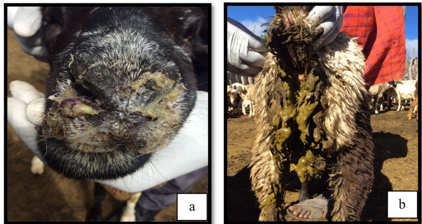
Fig. 1 A goat with mucopurulent nasal discharge (a) and a goat showing soiled behind with diarrhea (b)

The overall seroprevalence of PPR in this study was 74.6%. This seroprevalence is in line with findings from a recent study that analyzed samples from 14 regions of Tanzania, with Arusha region having an overall seroprevalence of 71.1% (Kgotlele et al. 2016). Other studies done in northern Tanzania have found PPR seroprevalence of 45.5% in 2008 (Swai et al. 2009) and 22.1% in 2008–2009 (Kivaria