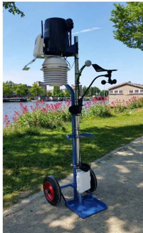
Fig. 2 Mobile weather station. Davis Vantage Pro2 instrument installed on a wheel hand cart

To measure the meteorological conditions and estimate the PET, we equipped two-wheel hand carts with a Davis Vantage Pro2 weather station (see Fig. 2). This instrument includes sensors that measure air temperature, air humidity,