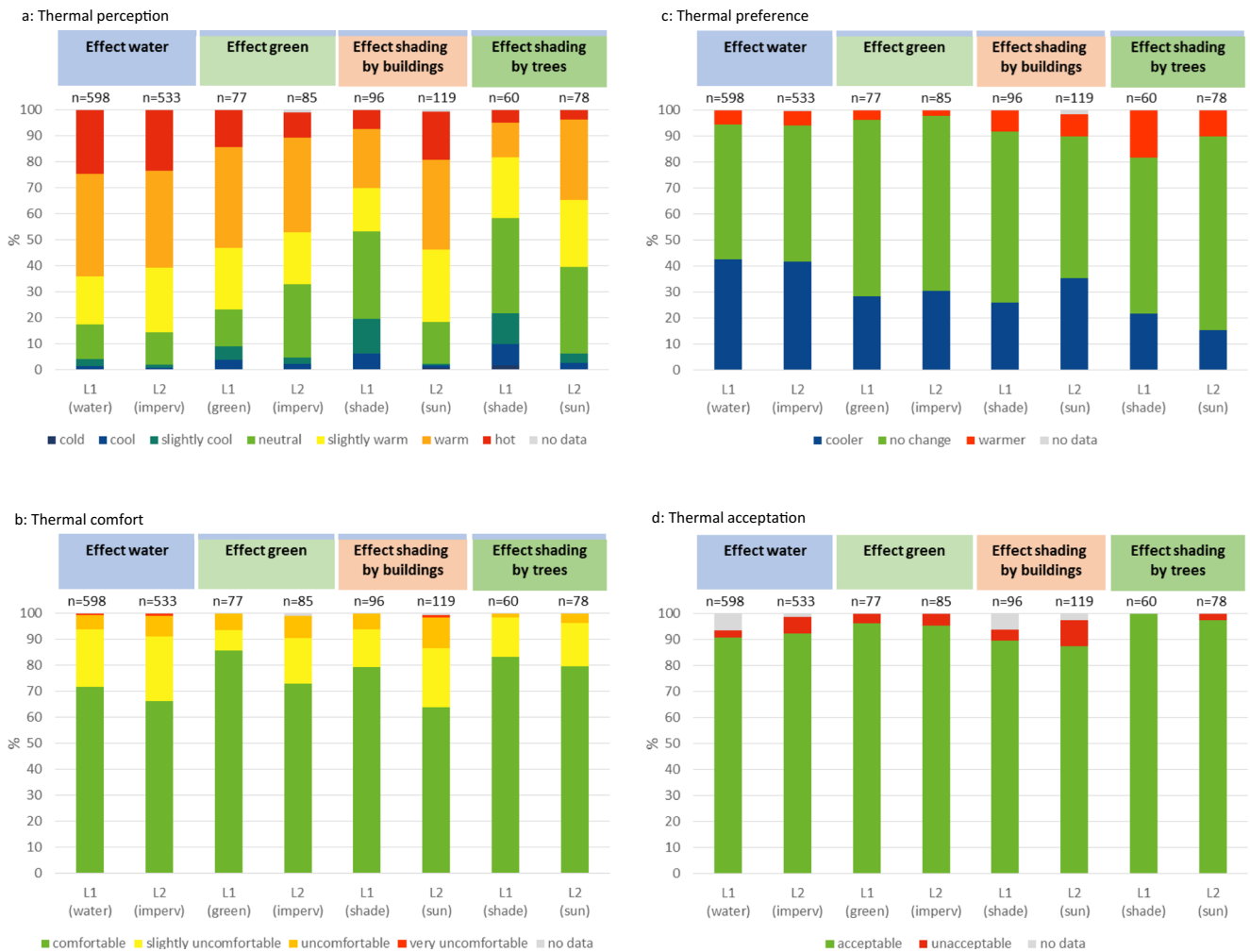
Fig. 4 Survey results showing the effect of water, green, shading by buildings and shading by trees on thermal perception (a), thermal comfort (b), thermal preference (c) and thermal acceptance (d). The thermal effects are indicated by presenting the respondent rates when data are grouped for L1 and L2 locations according to Table 5 (water:

nos. 1–7, green: nos. 8–10, shading by buildings: nos. 11–15, and shading by trees: nos. 16–19). The effect of shading by buildings on the thermal perception (a) and thermal comfort (b) are statistically significant ( p < 0.05 )