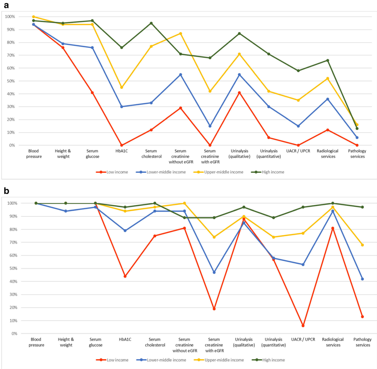
Fig. 1 Health care services for identification and management of chronic kidney disease by country income level. a Primary care (i.e., basic health facilities at community levels [e.g., clinics, dispensaries, and small local hospitals]). b Secondary/specialty care (i.e., health facilities at a level

higher than primary care [e.g., clinics, hospitals, and academic centers]). eGFR, estimated glomerular filtration rate; HbA1C, glycated hemoglobin; UACR, urine albumin-to-creatinine ratio; UPCR, urine protein-to-creatinine ratio. Data from Bello et al. [4] and Htay et al. [42]