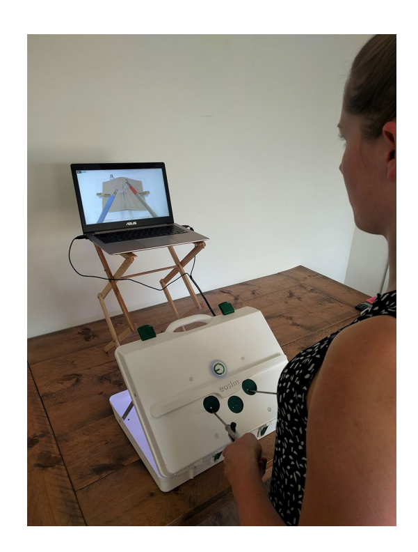
Fig. 1 Set up of the eoSim as used in this study

In this study, the eoSim augmented reality laparoscopic simulator by Eosurgical ltd., Edinburgh, Scotland, United Kingdom was used in a standard setup (Fig. 1). This setup consisted of the eoSim laparoscopic case with an internal mounted high-definition camera and standard supplied equipment that consists of laparoscopic instruments, needle holders, suturing pad, thread transfer platform and a box with standard exercise equipment. A 15-in. laptop with the required specification as recommended by eoSurgical with the eoSurgical Surgtrac software installed. The tracking camera that is mounted in the case was connected to the laptop via USB 2.0. The Surgtrac software allowed for instrument tracking by means of the coloured markings on the instruments (right=red, left=blue). Placement of the laptop screen was adjusted to the proper height for every participant with the laparoscopic box being placed on a standard height table. The 30-mm curved needle braided thread sutures were used to perform the tasks.