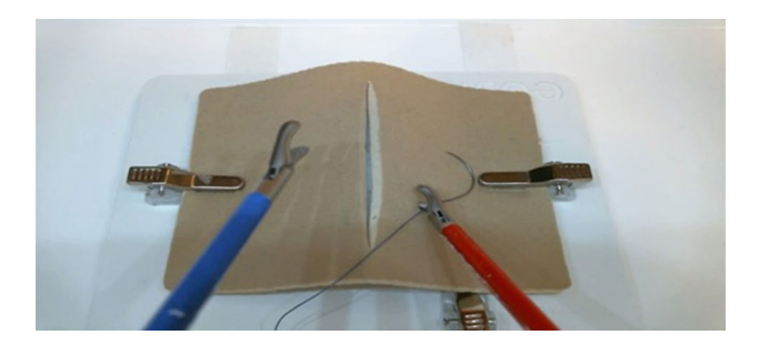
Fig. 2 Screenshot of the vertical defect suturing (Task 1)

The questionnaire used in this study was previously used in other validation studies [21, 22]. The questionnaire consisted of two parts, in which the first part contained the informed consent, demographics including age, dexterity, previous simulator experience and the participant's current laparoscopic experience. The laparoscopic experience was elaborated as current profession, years in surgical/gynaecologic/urologic training and number of basic and advanced laparoscopic procedures performed. Basic laparoscopic procedures were defined as non-suturing procedures, such as cholecystectomy and appendectomy. Advanced laparoscopic procedures were defined as procedures with intracorporeal suturing, such as gastric fundoplication, bariatric surgery or colon surgery. The second part of the questionnaire consisted of questions on the