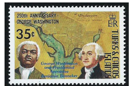
Banneker and Washington