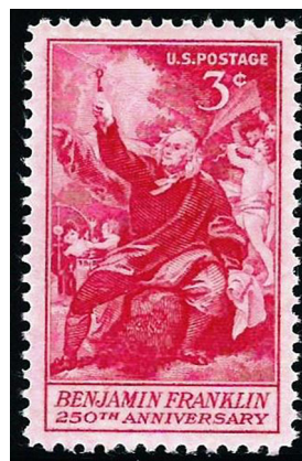
Franklin's lightning experiment