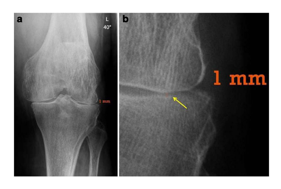
Fig. 2 Example of weightbearing flexed radiographs (Schuss-view) and of the measurement of the most pronounced narrowing of the joint space width; a overview; b detail

Pre-operative WOMAC total and WOMAC subscores showed no significant differences between Group 1 and Group 2 (Table 1). Post-operatively, the WOMAC total was significantly