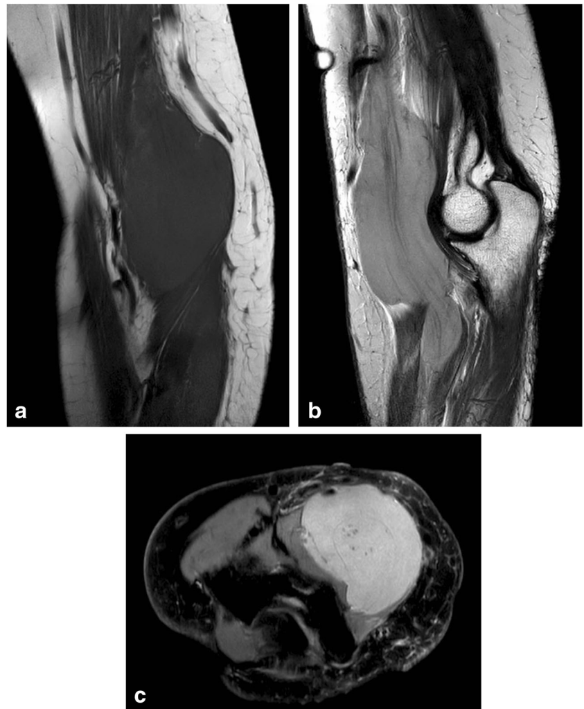
Fig. 1 a Coronal T1W SE, b sagittal T2W FSE, and c axial fat-suppressed PDW FSE MR images