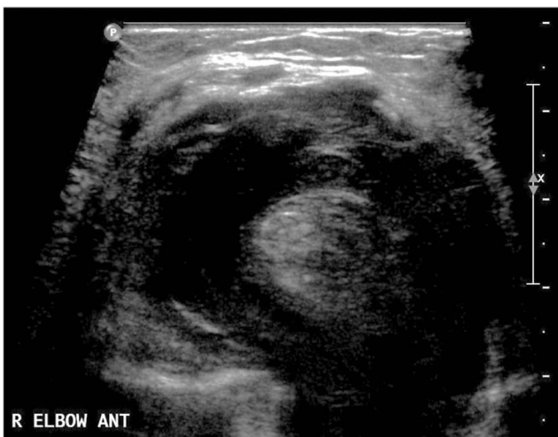
Fig. 2 Transverse US image