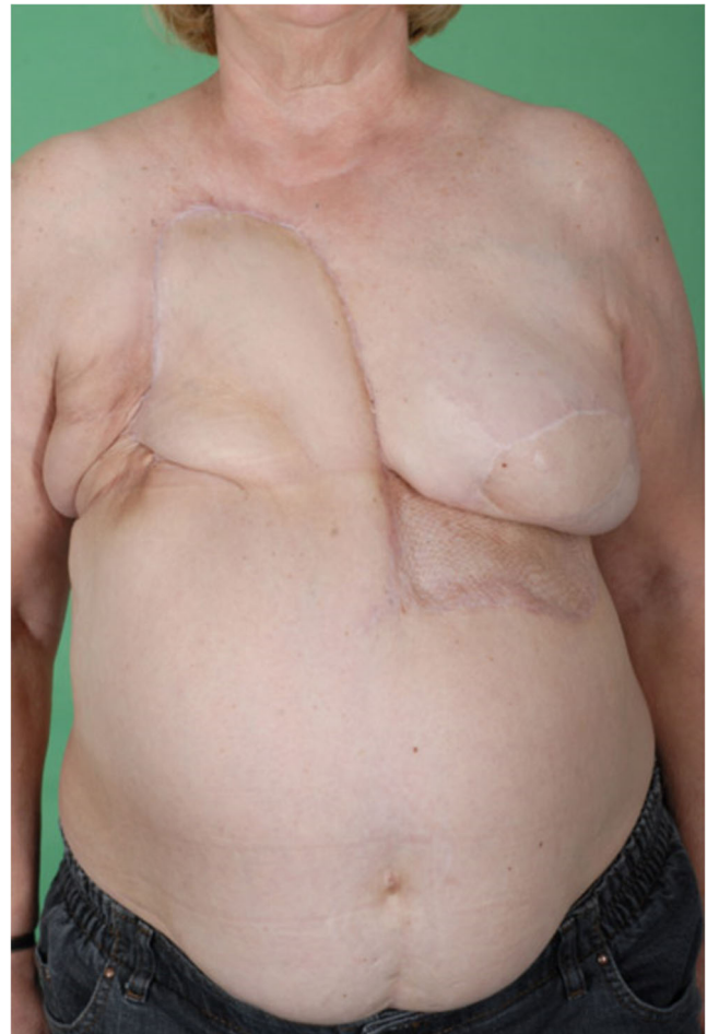
Fig. 2 A transposition flap was required to reconstruct right anterior chest wall defect, following neo-mastectomy

A 71-year-old patient was diagnosed with multifocal, grade 2, oestrogen and progesterone positive, invasive ductal carcinoma of her left breast in 2007. She underwent left mastectomy, axillary node clearance (3/13 positive nodes) and immediate deep inferior epigastric perforator (DIEP) flap reconstruction. Post-surgery, she required adjuvant chemotherapy, two field radiotherapy (50 Gy in 25 fractions) to her left reconstruction and hormonal (anastrozole) therapy. In 2011, she developed a ‘bruise’ to the lower inner quadrant of her left reconstructed breast. A skin biopsy was taken and suggested benign papillary haemangioma only. The discolouration settled after the biopsy, and 5 years later (April 2017), she re-presented with a rash to the lower inner quadrant of her left reconstructed breast (Fig. 3a). A core biopsy and an excision skin biopsy were performed, which suggested a vascular process, not typical of angiosarcoma. After the biopsies, the rash had almost completely gone and the patient was then kept under close observation once every 2 months. By November 2017, she returned with a widespread purple discolouration to the skin paddle of her DIEP reconstruction that extended onto the lower mastectomy skin flap (Fig. 3b). Repeat excision biopsies suggested the presence of malignant spindle cell proliferation, which stained positively for CD31 and CD34, confirming the diagnosis of angiosarcoma. This patient was referred to the