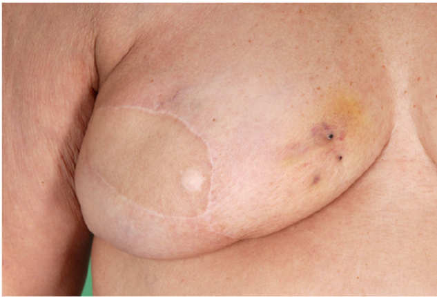
Fig. 1 Five years post-radiotherapy, patient developed skin discolouration and a small necrotic skin nodule to the lower inner quadrant of her right reconstructed breast, over the mastectomy skin flap

mastectomy was curative for angiosarcoma and she required no further treatment. A year after her chest wall reconstruction, the patient opted for follow-up locally by the breast surgery team. To date the patient remains disease free.