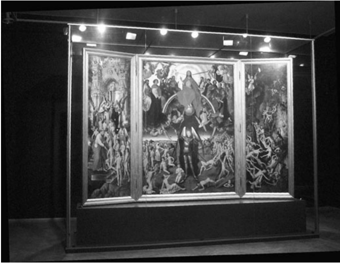
Fig. 16. The Last Judgement by Hans Memling (ca. 1430-1494).