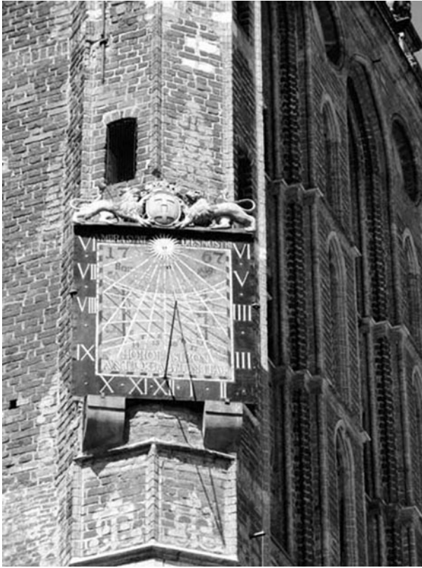
Fig. 3. The solar dial of 1588.

(figure 4) to the famous physicist Daniel Gabriel Fahrenheit (1686–1736), 4 who was born in Gdańsk but spent most of his life and died in Holland, nevertheless always maintaining a connection to his native town. His greatest achievement was the construction of the first reliable thermometers, filled with quicksilver (mercury) and based upon two fixed points, the freezing and boiling points of water. He was elected as a Foreign Member of the Royal Society of London in 1724; his mastery had been extolled at its meeting on March 5, 1723: