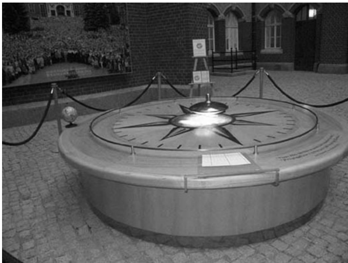
Fig. 18. The Foucault pendulum.

In addition to these universities, a visit to the Cathedral with its famous organ, one of the largest in Poland, is very worthwhile. The Cathedral is also located in Oliwa and formerly was the Cistercian Abbey, founded in 1186, where the monks had a printing shop in which scientific books and papers also were printed. These included the world's first account of the supercooling of liquid, which the Gdańsk physician Israel Conrad (1634–1715) observed in 1670, and the less-serious Physica Curiosa that the Jesuit Adalbert Tylkowski (his exact birth and death years are unknown) edited in 1680 as Part VI of the Philosophia curiosa , which attracted great interest in Europe. The Abbey's magnificent park and its surrounding wooded hills and valleys abound in enchanting sights. Also worthwhile is a visit to the Zoological Garden, the largest one in Poland, which is also located in this enchanting district of Gdańsk.