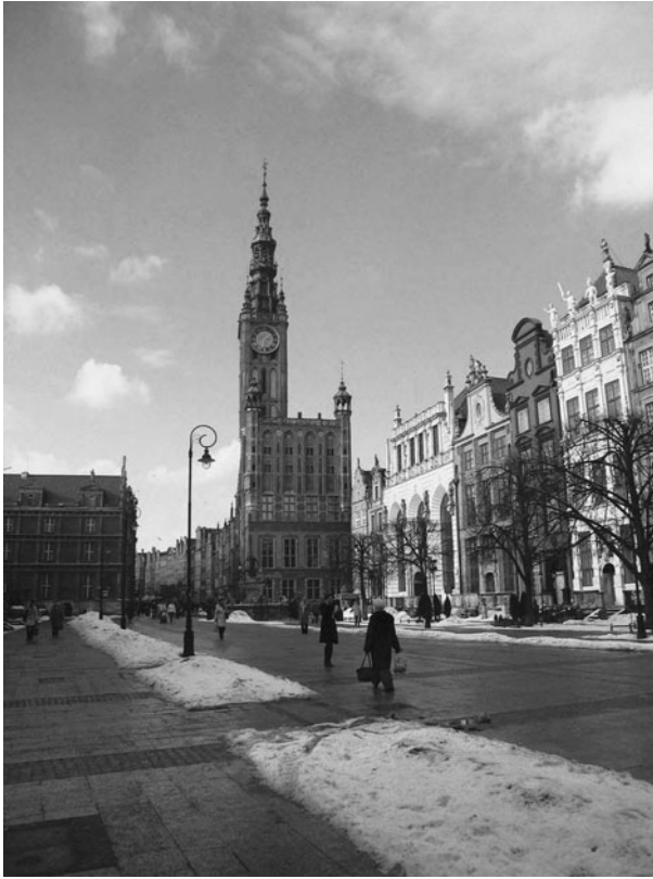
Fig. 1. The Long Market in Gdańsk, showing the Town Hall.

54^{\circ}21' N by the clockmaker Wolfgang Günther ( ca. 1610–1659), who worked for the famous Gdańsk astronomer Johannes Hevelius (1611–1687). As a member of the Council of the Old Town (another district in the City of Gdańsk), Hevelius had to attend the meetings of the Right Town Council. He surely had observed the error in latitude on the sundial and moved his colleagues of the Right Town Council to correct it.