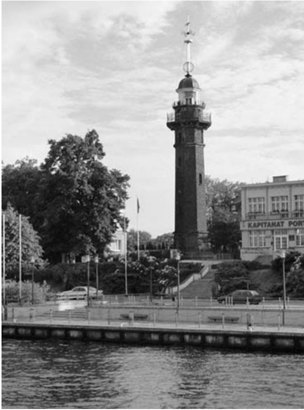
Fig. 19. The light house in New Port ( Nowy Port ) with the time ball.

ships in the harbor. Today, the time ball is released every two hours by an electrical pulse sent out by the European Time Service.