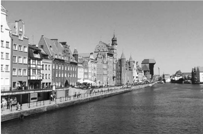
Fig. 6. The Long Bridge (Long Quay) with the medieval crane in the background.

to a height of 11 meters, or, if only the upper drums were used, 2 metric tons (2000 kilograms), which could be raised to a height of 27 meters. The wooden machinery, which was destroyed by fire during the Second World War, has been reconstructed, and the rebuilt crane is now part of the attractive Maritime Museum, which extends to the rebuilt granaries on the opposing Ołowianka (Lead Year) island.