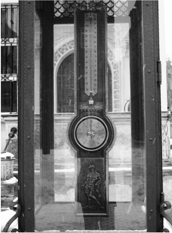
Fig. 4. The Fahrenheit monument, meteorological station.

Fahrenheit also discovered and measured the changes in the freezing and boiling points of water with atmospheric pressure. Further, he invented the cascade method of cooling, and hence may be regarded as a pioneer of cryogenics, having reached a record low temperature of 40 degrees below zero (which is identical on both the Fahrenheit and Celsius scales) in 1730. The Fahrenheit monument in the Long Market is unique: it has the shape of a meteorological station with an enlarged copy of a lost 1752 Gdańsk thermometer connected to an aneroid barometer—one of the first in the world. The temperature can be read in both Fahrenheit and Celsius degrees, and the pressure in millimeters of mercury and—as a modern addition—in hectopascals. A memorial plaque to Fahrenheit is on the rebuilt façade of his birthplace, some 100 meters up the neighboring street, at 95 Ogarna (Hound) Street.