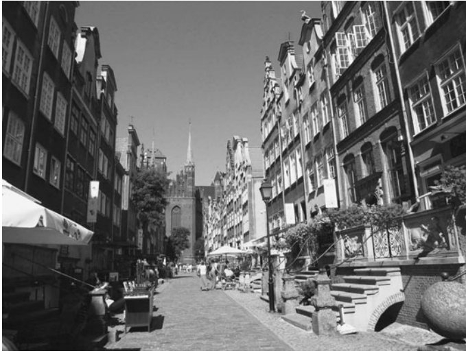
Fig. 8. Mariacka (St. Mary's) Street.

was Peter Andreas Hansen (1795–1874) from Gotha, who developed equations to describe its motion. 11