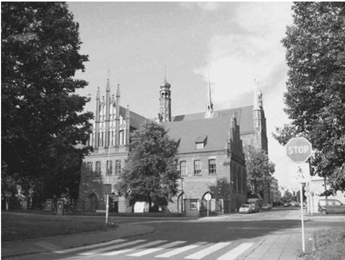
Fig. 15. The former Academic Gymnasium , today the National Museum.

We next visit the ancient Franciscan monastery, which today houses the National Museum (figure 15) located on Toruńska Street in the Old Suburb. After the Reformation, the monks who had built the monastery in the 15 th century were compelled to transfer it to the City Council, who first converted it into a secondary school and then, in 1580, into the Academic Gymnasium . In 1596 the famous Gdańsk Library was added—which now belongs to the Polish Academy of Science and is in a newer building in Watowa (Wall) Street. Many famous scientists taught or studied in the Academic Gymnasium , the most universal one being Bartholomeus Keckermann (1572–1609), who lectured and published on logic, mathematics, geometry, optics, astronomy, geography, ethics, politics, economics, philosophy, metaphysics, rhetoric, and physics. His Systema physicum , published in Gdańsk in 1610, went through several editions, including foreign ones. His colleague, the astronomer and mathematician Peter Krüger (1580–1639), was the first to formulate the law of cosines and to elaborate logarithmic tables in which the logarithms of trigonometric functions were separated from those of numbers. 17 The geographer Philip Clüver (1580–1622), who later became a professor in Leiden and founded the field of historical geography, set the eastern border of Europe as the Ural river. Heinrich Kühn (1690–1769) created a prototype of