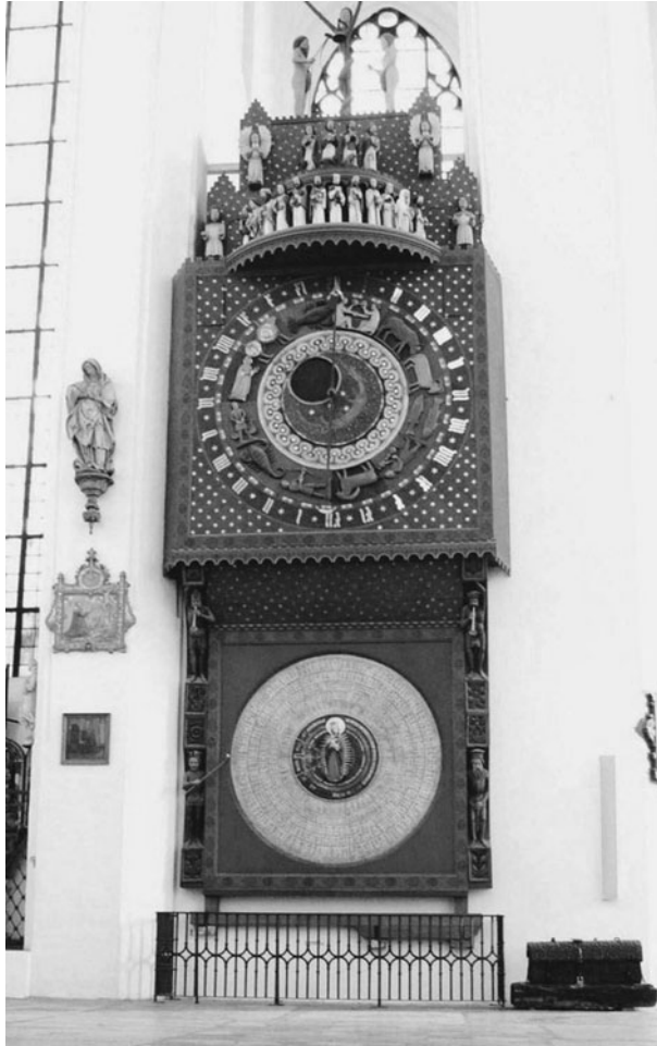
Fig. 11. The Astronomical Clock of 1470 in St. Mary's Church.

The ingenious system to indicate the phases of the Moon consists of an external dial that moves together with the Sun's plate once around the Zodiac in one tropical year, and an internal dial that is connected to the Moon's plate, which makes one complete revolution in one sidereal month. The internal dial is divided into two fields, black and golden, while the external dial has an oval opening through which part of the surface of the internal dial can be seen. Their combined movements change the proportions of the black and golden fields of the internal dial in the oval opening of the external dial with a periodicity of one synodic month. At New Moon, the field in the oval opening is black; at Full Moon, a serene