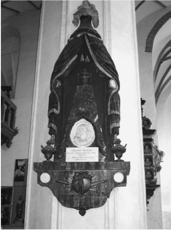
Fig. 13. The epitaph of Johannes Hevelius (1611–1687) in St. Catherine's Church.

settings. He also invented the periscope, which he called a polemoscope . Under his guidance, the clockmaker Wolfgang Günther ( ca. 1610–1659) constructed the first pendulum clocks at the same time as did his famous Dutch contemporary Christian Huygens (1629–1695).