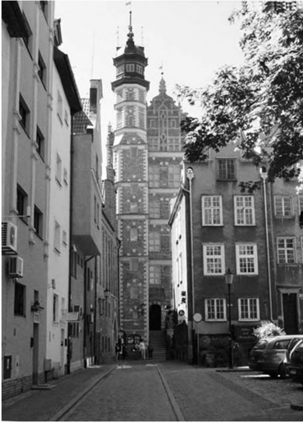
Fig. 9. The Naturalists House, today the Archeological Museum.