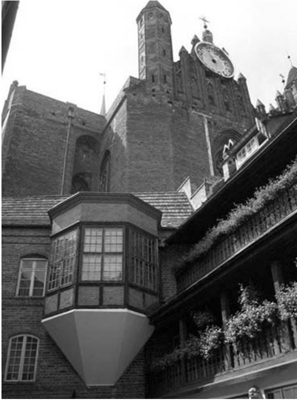
Fig. 10. The courtyard of the Old Vicarage.