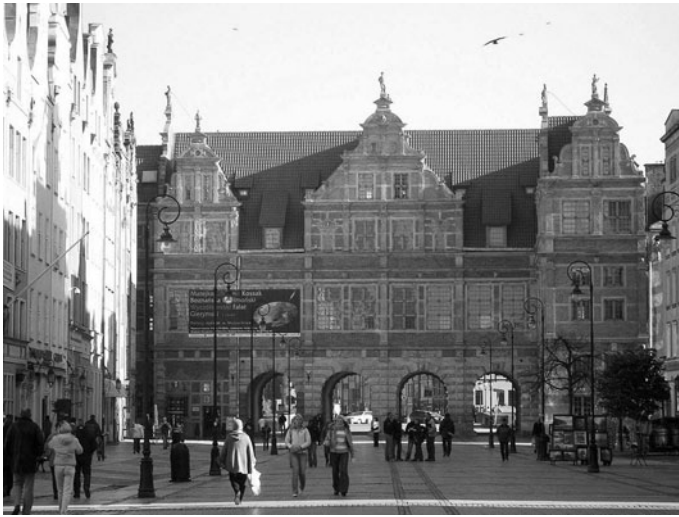
Fig. 5. The Green Gate, the former seat of the Societas Physicae Experimentalis .