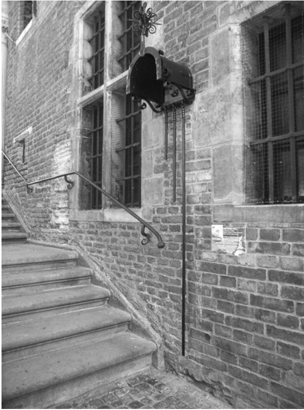
Fig. 2. The historical standards of length of Gdańsk.

rotating drum that was set in motion by the tower clock mechanism each hour on the hour. As the drum revolved, the pins raised the bell hammers by means of bars and wires, and when they dropped the bells played in a preset sequence. The tunes they played were recorded in the tower books by indicating the positions of the pins on the drum. I and a group of musicians from the Gdańsk Academy of Music managed to decipher them, so we now can listen to the old tunes played on the new bells, which are recorded on chips that control the electromagnetically driven hammers. The tunes are changed every week. There also is a special counter, with a manual and pedal that carillon virtuosi use to give regularly scheduled concerts.