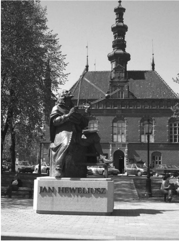
Fig. 14. The monument to Johannes Hevelius (1611–1687).

Hevelius also continued to measure the magnetic declination in Gdańsk and discovered its secular changes. Another Polish King, Jan II Kazimierz (1609–1672), rightly claimed that Hevelius “will be the ornament and pride of Gdańsk in the centuries to come,” 16 as future generations confirmed. They erected an impressive monument to Hevelius in front of the Town Hall in the Old Town (figure 14). The Town Hall, built by Anthoni van Obberghen (1543–1611) in 1594 and not destroyed in the last war is very worthwhile visiting. In its two-story cellars Hevelius used to store his beer. In the large Hall on the upper floor he attended assemblies and sessions of the court.