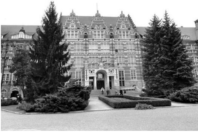
Fig. 17. The Main Building of the Technical University of Gdańsk ( Politechnika Gdańska).