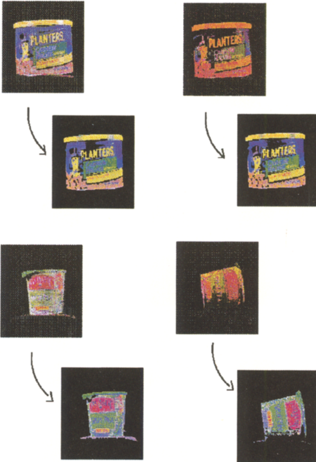
Fig. 2. A peanut container is imaged under two different lighting geometries and illuminant colours (top of figure). After comprehensive normalization the images appear the same (2nd pair of images). A pair of 'split-pea' images (third row) are comprehensively normalized (bottom pair of images). Notice how effectively comprehensive normalization removes dependence illuminant colour and lighting geometry