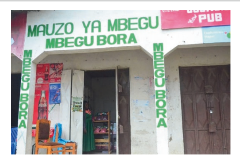
Fig. 3.22 Beula Seed Company Agrovet Shop in Uyole, Mbeya, Tanzania