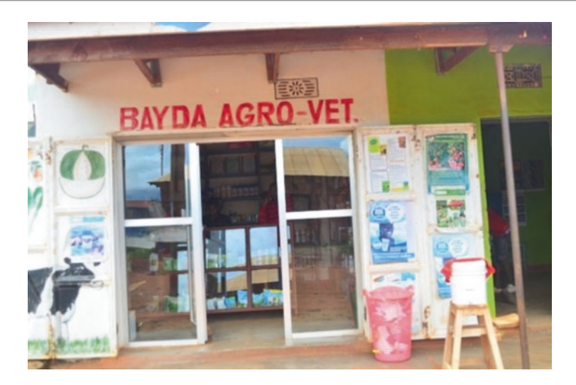
Fig. 3.14 Establishment shot of one of the Bayda Agro-Vet co. Shops in Mbulu, Manyara District, Tanzania