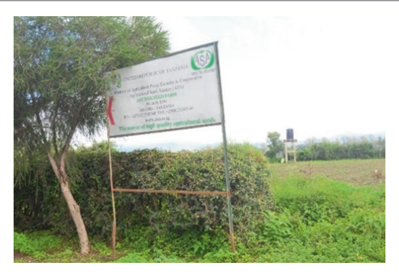
Fig. 3.21 Establishment of ASA-Arusha Farm in Arusha, Tanzania