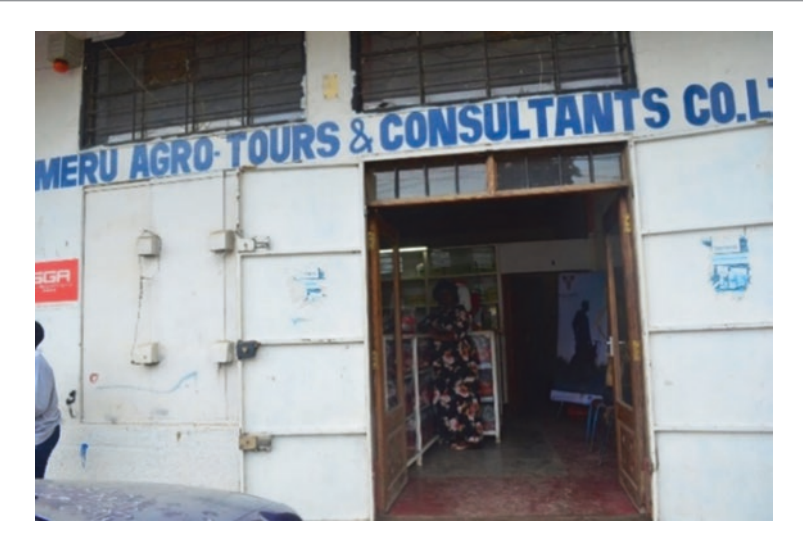
Fig. 3.16 Establishment of Meru Agro-Tours & Consultants Co. Ltd. shop in Arusha Mjini, Tanzania