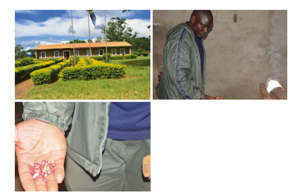
Fig. 3.18 ASA Mbozi Offices in Mbozi, Tanzania

Marco adds that they try to make their seeds accessible, so they look into their distribution channel down to the ward level. They even collaborate with farmers to try and sell the seeds. Last season they farmed on 30 acres with the farmers who received subsidies. When it comes to selling their produce, they package the seeds into 2 kg to 50 kg packages which they sell to farmers.