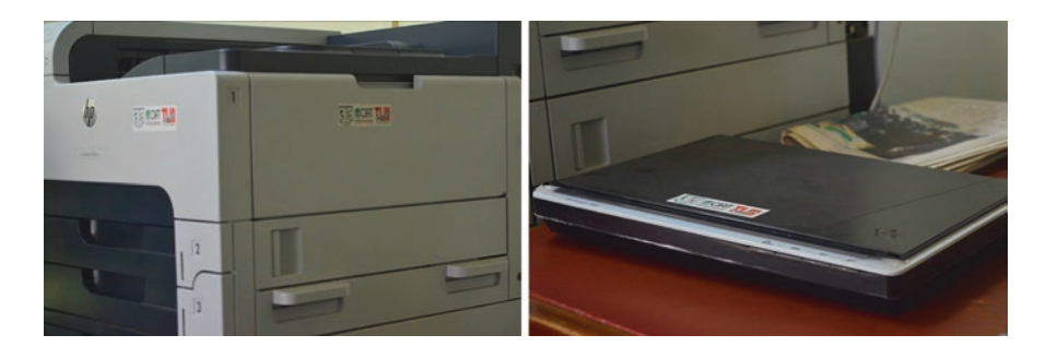
Fig. 3.9 Printers and laptops, some of the other equipment Selian Institute in Arusha have benefited from TL III project