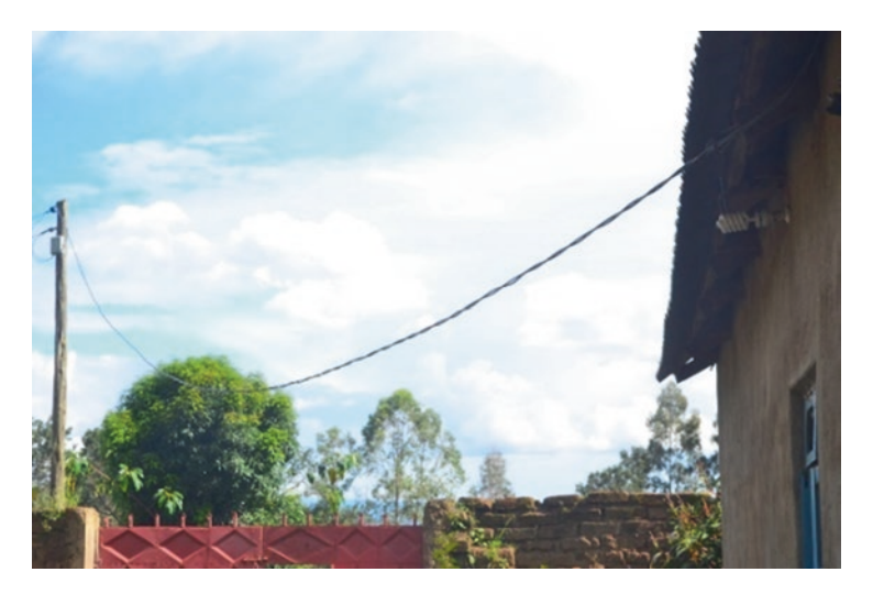
Fig. 3.25 Electricity connection at Zinduka Women Group chairperson, Ms. Witness Sikayanga's homestead in Mshewe, Mbeya, Tanzania

since they did not have good yields. The newly released varieties have had a positive impact on the farmers. Since the group solely involve women, changes around them have been visible to the general public. They can now cash in on home amenities such as improving the level of their living standards, buying more arable land for farming, and connecting their homes with electricity (Fig. 3.25).