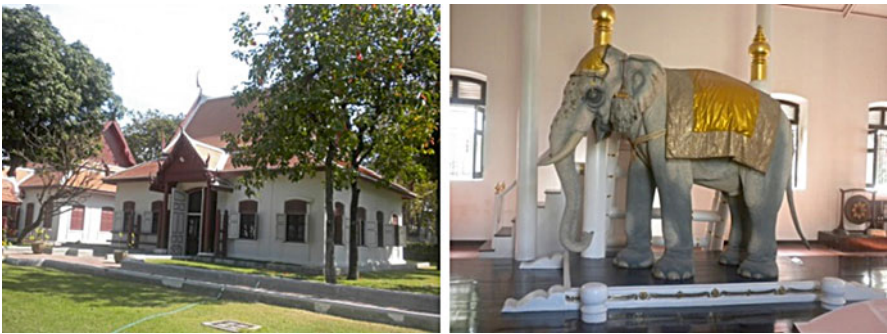
Fig. 6 The Royal Elephant National Museum in Bangkok