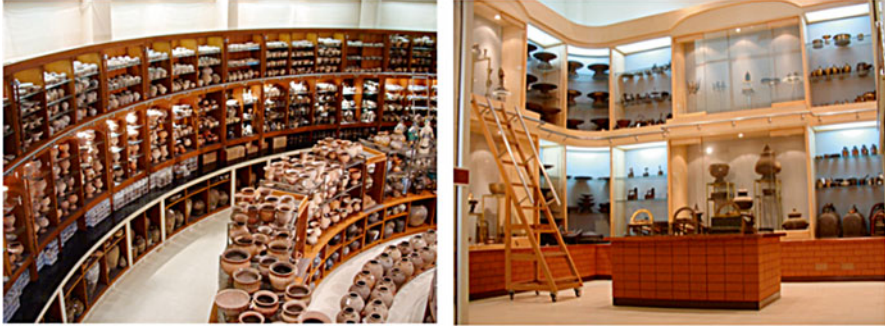
Fig. 8 Inside of the actual National Museum Storage in Pathumthani Province

Many national museums have attempted to change by themselves under limited conditions: contacting outsourcers, managing a youth museum guide, finding volunteers, creating museum souvenirs, and so on. Anyway, as mentioned before, this depends on each national museum's potentiality and readiness. It is very gratifying that many national museums, such as regional national museums and medium-scale museums like the Suphanburi National Museum, Ban Chiang National Museum, Roi-Et National Museum, Chiangsaen National Museum, and Surin National Museum have been established.