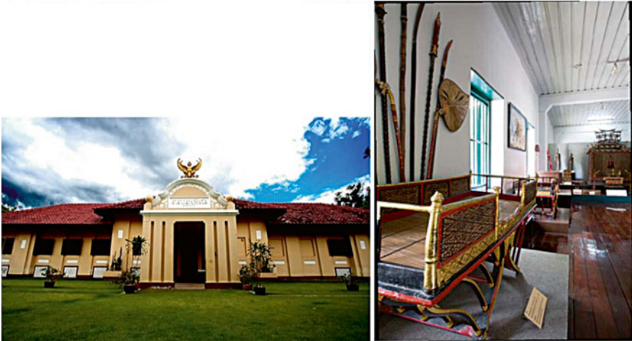
Fig. 7 Ubonratchathani National Museum