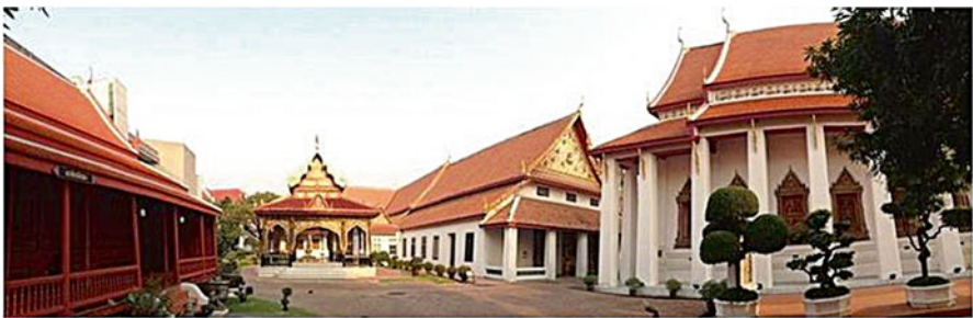
Fig. 10 National Museum Bangkok

Most of the collection comprises masterpieces that are very well known (Figs. 10 and 11).