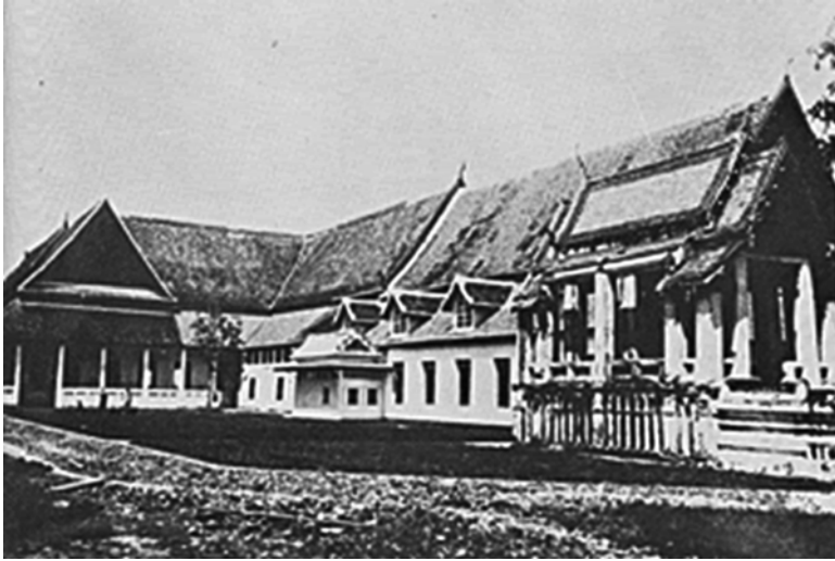
Fig. 3 Old Palace of Wang Na, as Museum for Phranakhon

Bangkok,” and all museums established both before and after 1934, which were under the Fine Arts Department, now had the status of national museum.