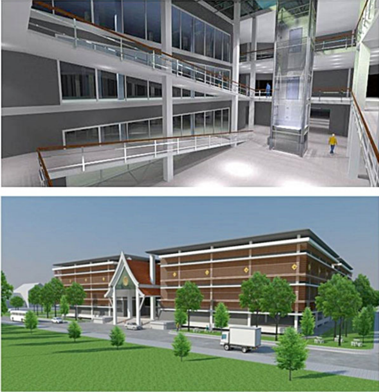
Fig. 9 A conceptual construction of a new central national museum's storage in Pathumthani Province