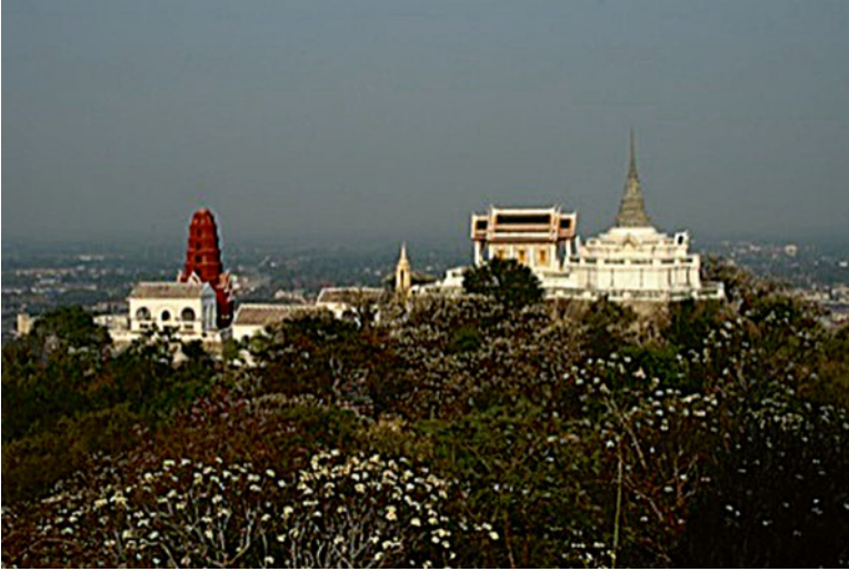
Fig. 4 Phanakhonkhiri National Museum, in Phetchaburi Province, old palace during the reign of King Rama V