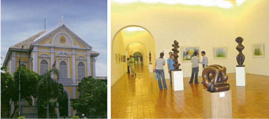
Fig. 5 The National Gallery, Bangkok