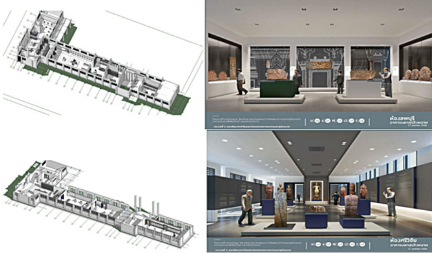
Fig. 11 Conceptual design of exhibition inside two buildings, National Museum Bangkok

museums in the provinces have ethnological sections in their gallery, with consideration given to ethnic people in the province and its surroundings. It is planned to intensively tell the story of all ethnic groups in Thailand at the Kanchanaphisek National Museum, under the titles “Window of Ethnology,” “Way of Ethnographical Lives,” and “Ethnographical Identity.”