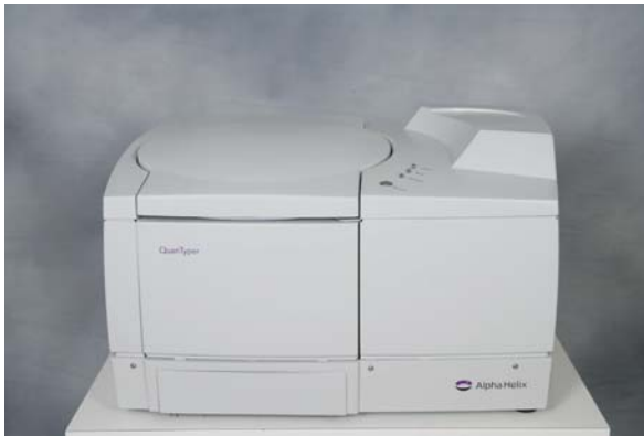
Fig. 4.3 Rapid sequencing of the viral genomes. QuantTyper™-48, from AlphaHelix Molecular Diagnostics AB, is the first real-time thermo cycling instrument utilizing SuperConvection™ to speed up the cycling process. This is achieved by subjecting the samples to high g-force, (via centrifugation), while cycling the temperature. The result is an increased mixing of the sample fluid that improves both the temperature homogenization and the kinetics of the reaction. This makes the QuantTyper-48 very fast but also very flexible with a vast sample volume range, accommodating reactions from 20 to 200 \mu\text{L} in volume using standard PCR-tubes. Typically a 20 \mu\text{L} real-time PCR assay is ready within 15 min while a 200 \mu\text{L} reaction takes up to 50 min to complete. Since such viruses can also be important factors in various diseases, it is important to work on methods, which facilitate their detection

In order to facilitate the detection of such viruses a range of molecular methods have been developed, in order to genetically characterize new viruses without prior in vitro replication or the use of virus-specific reagents. In the recent metagenomic