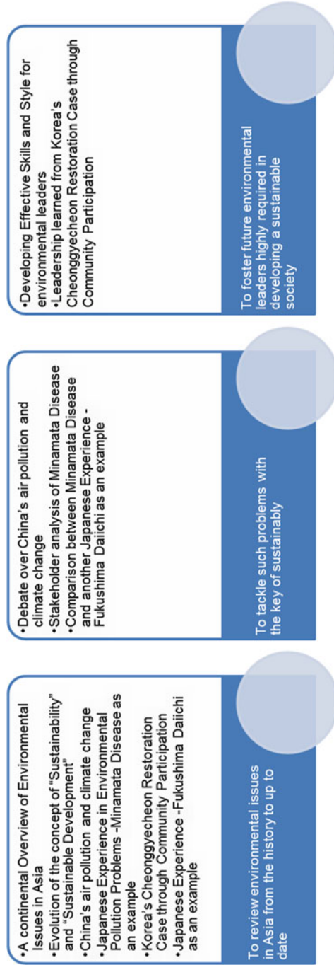
Fig. 3.2 Course syllabus