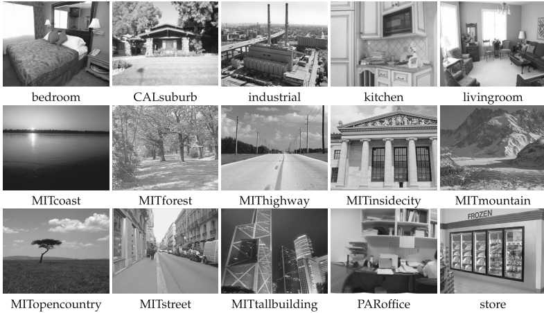
Fig. 2. Example images from the Scene-15 dataset.