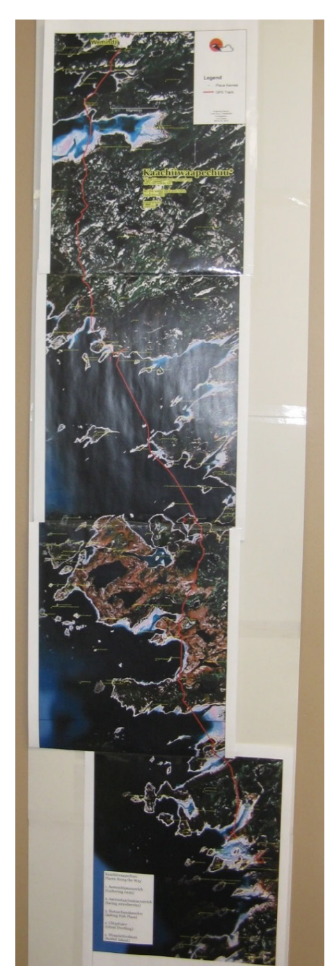
Fig. 2. Google Earth with kaachewaapechuu GPS line (Community Centre, Wemindji)