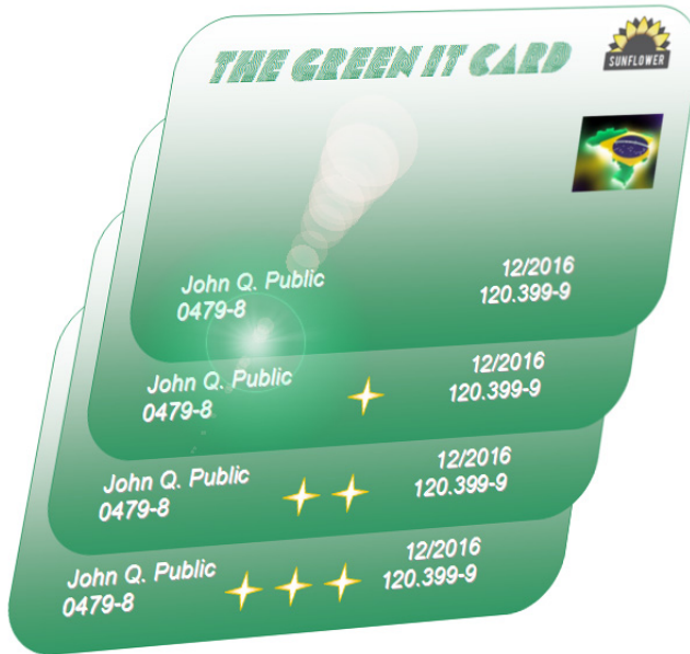
Fig. 3. The four green cards