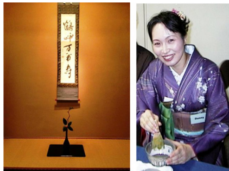
Fig. 3. The traditional culture in Japan

However, the contents of exercise of the tea ceremony do not stop only at them. In the field of lessons, the pupil would learn the traditional culture of Japan, such as the following as well as manners and way of temae or otemae . That is, Ikebana (arranged flower), the meaning of a kakejiku (hanging scroll), incense, tools, a tearoom and the yard, confectionery, Japanese clothes ( wafuku ), kaiseki ryori (dishes served before tea ceremony), and so on. That is, the opportunity to learn traditional Japan culture synthetically is condensed by exercise of the tea ceremony. In Figure 3, we can see Kakejiku and Ikebana (left photo) and Wafuku (right photo that the first author is wearing a Wafuku ).