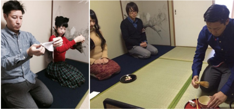
Fig. 2. State of the practice

Exercise of such divided operation is called “ Wari Geiko ” in Japanese. Although exercises of the tea ceremony are one to one fundamentally, in this stage, two or more pupils may receive exercise simultaneously. After finishing mastery of these basic practices, a pupil performs the face-to-face training. The center of training is accomplishment in temae . Since the face-to-face training is in the mainstream, two or more pupils cannot be practiced simultaneously. Therefore, other pupils will play a visitor's role during a one pupil's exercise. In Figure 2, we can see training that is carried out at the same time more than one in the initial stage (left photo) and pupils those who play the role of customers except those who train (right photo).