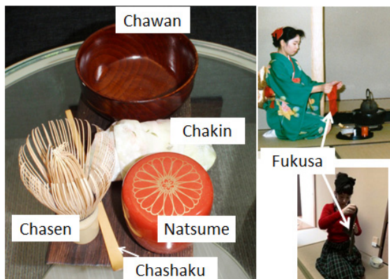
Fig. 1. Tea Utensils (Right: Chawan, Chasen, Chakin, Natsume, and Chashaku; Left: Fukusa)

The first step of the exercise in the tea ceremony is mastery of basic operation. Specifically, they are the manners in tearoom and temae (procedure for making maccha , that is, Japanese green tea, for guests as they watch). In practice, lessons would be divided the operation of the procedure for making tea, mastery of each part would be a challenge: how to fold the fukusa (silk cloth), how to inspect the chasen (tea whisk), how to wipe the chawan (tea bowl), container for powdered thin tea, tea scoop, how to fold chakin (a tea cloth). In Figure 1, we can see Chawan , Chasen , chakin , Natsume (which use to contain the powder of green tea), Chashakus (which is spoon for scooping into bowls green tea).