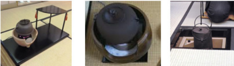
Fig. 6. kama (kettle) and furo/ro would vary depending on the season

In practice in remote location, the tea utensils are not perfect. Since there is no furo which is tool to boil water 5 , it is replaced by an electric kettle. Or, there is no coal, but to perform the practice with the intention of some.