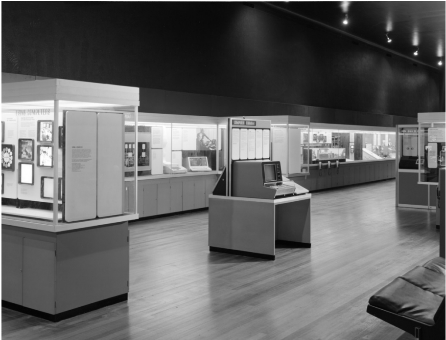
Fig. 1. Science Museum's gallery Computing Then and Now , 1975, showing the computer terminal that allowed visitors to interact with the Imperial College computer

The Science Museum's own computing gallery, Computing Then and Now , which opened just a few years later in 1975, is another interesting example of how contemporary ideas about computing were mapped onto a gallery space.