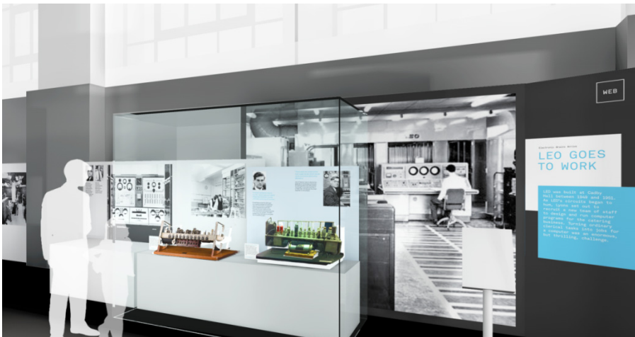
Fig. 4. Representation from Universal Design Studio of one part of the Lyons Electronic Office (LEO 1) story on the Information Age gallery, 2013