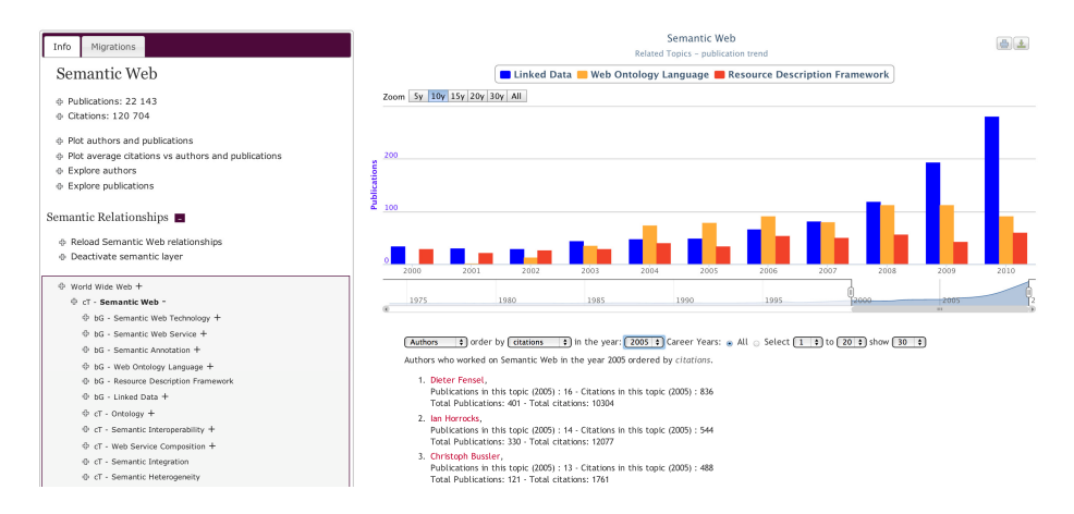
Fig. 2. Exploring the topic "Semantic Web" in Rexplore

For analyzing a topic, Rexplore provides an interface that includes: i) general information about the topic, ii) access to the relevant authors and publications, iii) the topic navigator , iv) visual analytics on broaderGeneric and contributesTo sub-topics, and v) visual analytics on authors' migration patterns from other topics to and from the topic in question. As an example, Figure 2 shows the page for the topic "Semantic Web", which (on the left) includes basic statistics, access to basic functionalities, and the topic navigator showing the relevant fragment of the topic hierarchy generated by Klink. On the right hand side of the figure, a histogram is shown, as the user has selected to visualize the publication trends for research in Linked Data, OWL and RDF. In particular, Figure 2 shows that the Linked Data area has exploded in the past few years, while research in OWL appears to have reached a plateau.