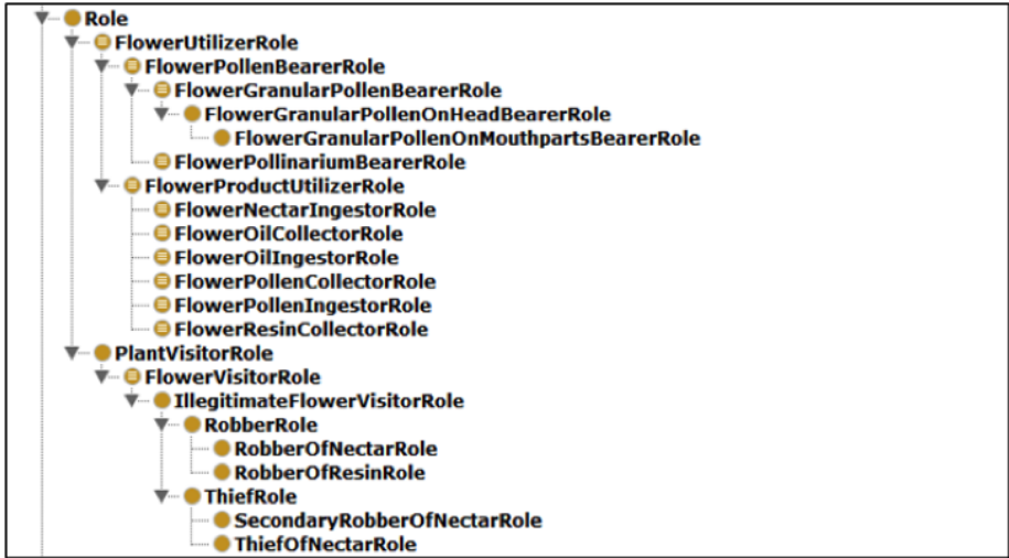
Fig. 1. The roles (concepts) in the asserted class hierarchy as displayed in Protégé 4.2

concepts from the Plant Ontology [11] where possible. In modelling flower-visiting we made extensive use of the Role concept as defined in BFO (the Basic Formal Ontology) [28]. Examples of roles include the role of a person as a surgeon or the role of a chemical compound in an experiment. We created -Role concepts for the activities associated with flower-visitors, and created an Object Property participates_in (inverse: participated_in_by ), thus a FlowerVisitor participates_in some FlowerVisitorRole . The -Role taxonomy is depicted in Figure 1.