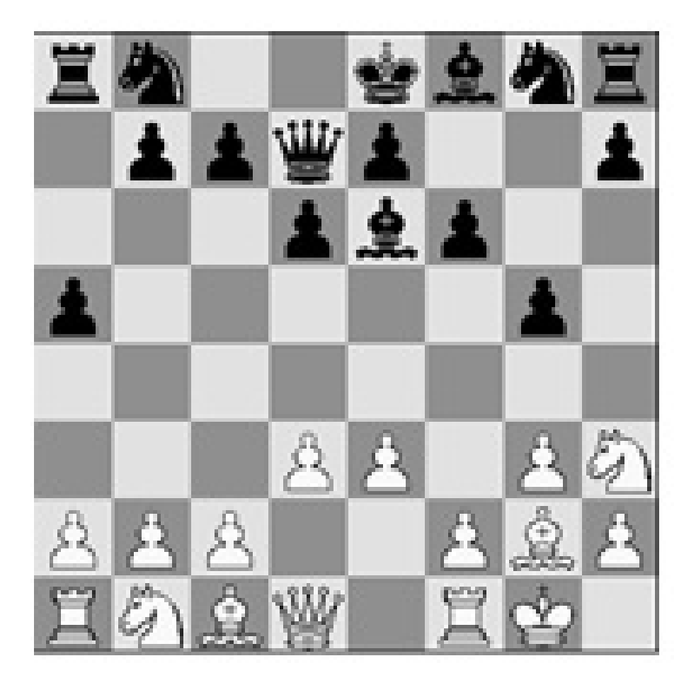
Fig. 3. Qh5+ and black replies with the critical mistake of Bf7. Why?