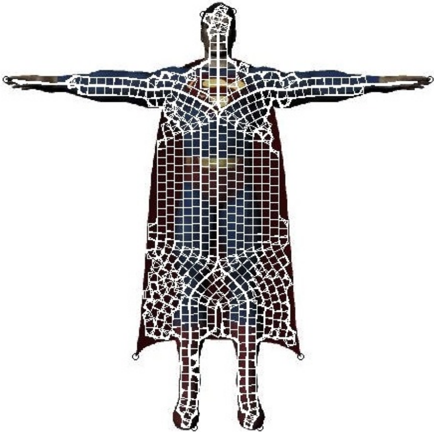
Fig. 2. The location of the watermarked blocks arranged in layers around the skeleton is illustrated for the Superman figure.