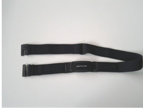
Fig. 2. Zephyr HxM heart rate monitor

heart rate, the points will double. To lower the heart rate for the relaxing mode, the gamer can take slow deep breaths or sit/lay down.