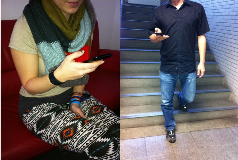
Fig. 4. Participant during relax mode (left) and during challenge mode (right)

Questioned if they would integrate or use their environment in a mobile game, e.g. running up stairs, the mean rating was 4.07 on a five-point-scale (1=would not integrate/use it, 5= would integrate/use it).