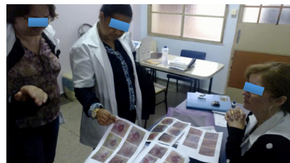
Fig. 3. Photos using personal cellphone to document physiotherapy results

One important observation made during the design session with the physiotherapist (Feb 23, 2012) is that she disclosed that she had recently used the camera on her cell phone to take photos of one of her patients recovering from an injury. She was planning to show some of the photos at a conference. However, she decided to print the photos and put them in a photo album documenting healing progression. One day, she showed the album to her colleagues that stimulated