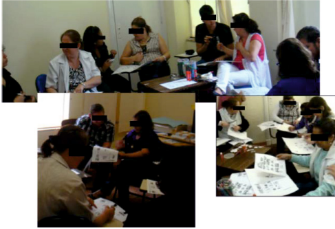
Fig. 2. PD activity with health professionals

social network and never bought something via internet; two use iPods and demonstrated abilities with ICT; all professionals had contact with touch technology, mobile phones and web search; none of them had contact with free-form gesture based technology. Our choice of PD was intended to avoid our own bias towards the