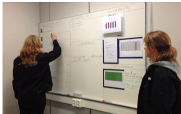
Fig. 2. Obtaining organizational learning through team boards

Current layout in the production line gives challenges in achieving transparency in the value chain. The production area is divided into sections where the operators are working in separate compartments which affect the information flow. The operators are not familiar with working in teams. Moving towards industrialization (knowledge stairs), it is necessary to formalize the information flow. To improve the transparency in the production area and create a learning environment with common arenas for information sharing and collaboration, team boards were introduced as the first step in a PMS implementation process. However, interviews and field studies revealed some resistance to this process.