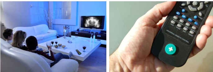
Fig. 6. Home hospital – family x-rays

'My daughter bought me this mobile phone in case of emergency, but I just keep it in the drawer.' Safety alarms, such as fall alarms, stigmatise users and establish communication with family and loved ones only in times of crisis that set up a situations of anxiety. Objects to cherish could provide a positive continuous 'link' and reminder by monitoring loved ones wellbeing. 'Love links' (Chamberlain, Bowen) (Fig. 5) monitors wellbeing by creating a permanent visual communication link between loved ones in the form of a precious gift e.g. jewelry (rather than device). An alert (lack of activity or fall) breaks the communication link causing change in the object activity (e.g. change of colour). Can we change the negative connotations of monitoring devices?