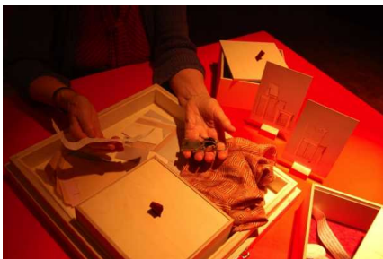
Fig. 3. ‘Exhibition in a box’

The research data gathered through the series of engagingdesign events has informed the creation of numerous ‘critical artefacts’ that prompt further discourse through ‘what if?’ scenarios. Some selected examples contained within the exhibition in the box that focus on our interaction with technology include the following.