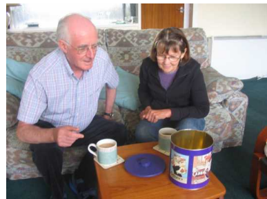
Fig. 4. Biscuit Buddy