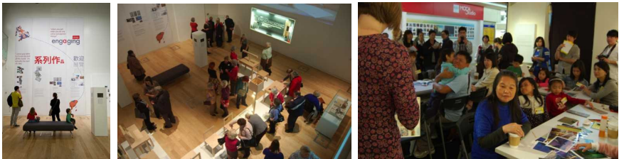
Fig. 2. Engaging people in the UK and Taiwan

The exhibitions, engagingdesign, (Fig. 2) provided the theatre for conversation and became the medium and method for further data collection. Linked to each of the exhibitions was a series of workshops that included, older people, families, design students, health students, medical professionals and the Chinese Community (Sheffield, UK).