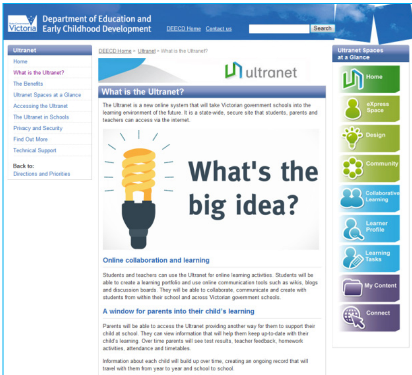
Fig. 1. What is the Ultranet?

According to DEECD's website [3] the Ultranet aims to: