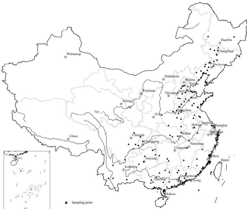
Fig. 1. Sampling points distribution map of 2008

140 sampling points (sampling points are as shown in Fig. 1) were set in major peanut production areas of China, the pods and corresponding soil samples of dominant peanut cultivars were collected, and then pod protein content, soil organic matter, available phosphorus, available potassium, PH, and other indexes were determined in accordance with national standards. The soil clay content is 2KM×2KM raster data from the Institute of Soil Science, Chinese Academy of Sciences[12,13]. Use extraction command in Arcgis9.2 software to extract the value of the sampling points.