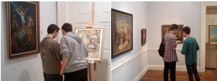
Fig. 3. Students of the mobile-based game were immersed in questions displayed on their mobile phones

The results highlight that the enrolment with the mobile affects their performance. However, both (paper-mobile) games persuade the children in several ways. A team benefits from a strategy and game characteristics seem to motivate and excite them for the activity. In addition, based on the observations of the researcher students seemed to be more focused and immersed on the mobile application (fig. 3). Interestingly, mobile application did not push students to lose their interest for the museum as many paintings and its features are discussed from students by the end of the experiment and on the respective course on school. Another notable observation is that students from both groups spent approximately the same total time at the gallery (19 min on average). This may be derived from students' familiarity with mobile phones and the simple design of the game.