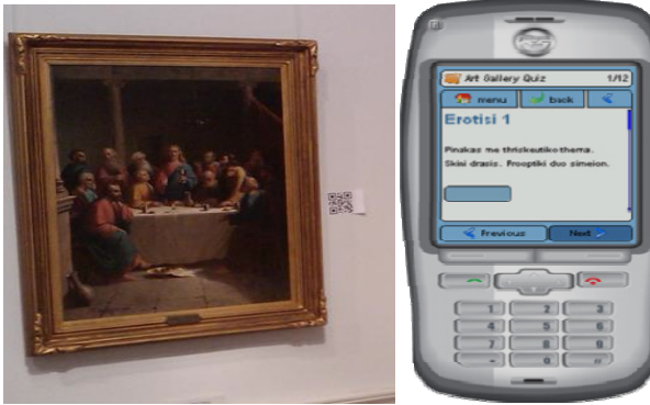
Fig. 2. The QR codes were placed next to the paintings (left), the mobile application (right)