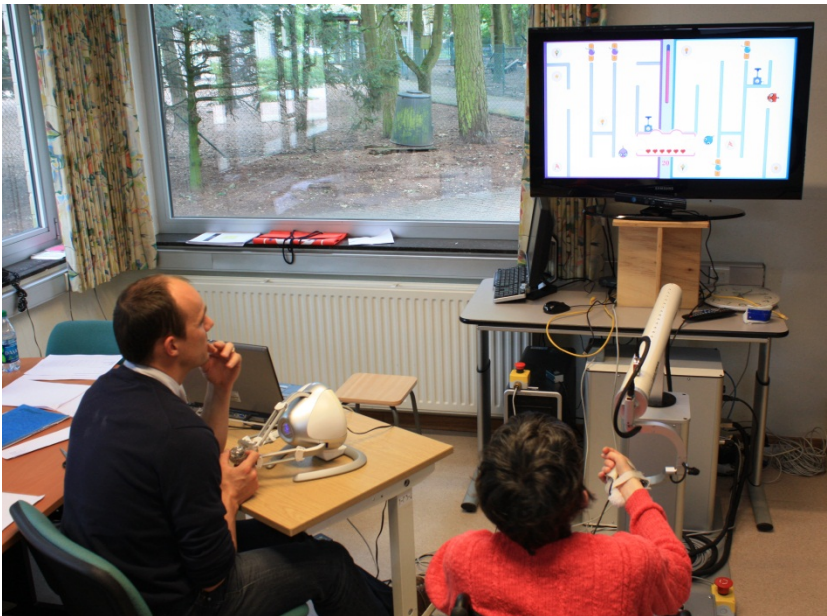
Fig. 1. System setup: with Novint falcon (therapist) and HapticMaster (patient)

The Social Maze, the collaborative training game described in the next section, was designed to combine several skill components. Furthermore, the collaborative nature of the game brings in a social aspect and stimulates interaction between patients and therapists.