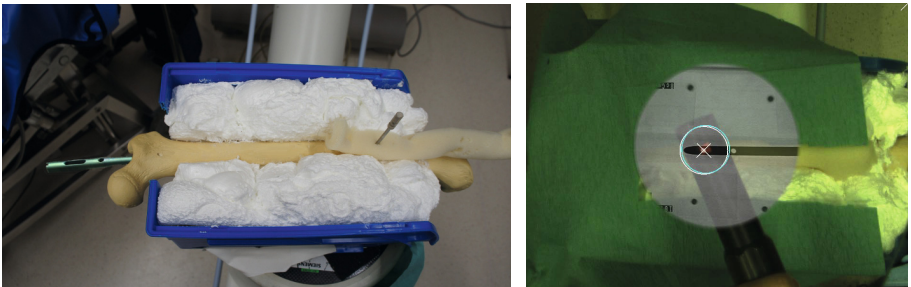
Fig. 3. (Left) The dry bone phantom setup with a nail inside the bone. (Right) The top ball of the drill guide is bounded by a blue circle.

Visualization in X-ray and Video Image. For our method, we employ the system calibration method described in [3] in order to align the projection geometry of an X-ray and video image. The estimated tip of the radiation-free drill guide is directly registered to the X-ray images. The target hole of the nail seen in X-ray is bounded by a white circle and marked with an x for its center. The radiation-free drill guide tip is marked with a yellow + and the top ball of the guide is bounded with a blue circle (fig. 2). The visualization colors and details were suggested by the surgeons participating in our study. The AR fluoroscopy system used was built by attaching a video camera (Flea2, from Point Grey Research Inc., Vancouver, BC, Canada) and mirror construction, covered by an X-ray source housing, to a mobile C-arm (Powermobile, isocentric