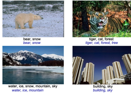
Fig. 2. Some examples of the labeling results