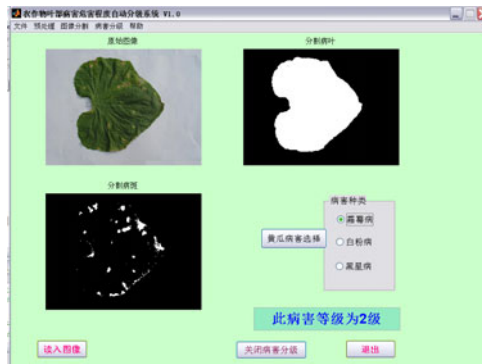
Fig. 3. Results of disease harm degree

Finally, according to the harm degree of plant disease and classification results, disease grade was shown, especially for cucumbers, grapes and corn disease harm degree of determination, specific for disease automatic grading of cucumber downy mildew, powdery mildew and scab, grape downy mildew, powdery mildew and anthracnose and corn big spot, leaf blight and grey spot disease. The results interface of the crop disease harm degree is shown in Fig.3.